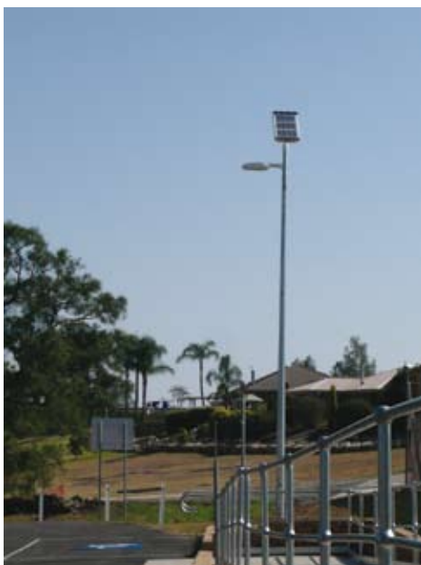
Installation for Toowoomba Regional Council.

Long term, solar LED lighting provides freedom from ongoing electrical bills and can cut maintenance costs by eliminating bulb changes and reducing maintenance cycle frequency.