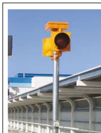
Solar hazard warning light at Cairns

In order to improve safety on the airside service roads, Cairns International Airport turned to Orion Solar Pty Ltd to provide hazard warning lights which are used when passengers are present. The airline attendant escorting the passengers from the terminal operates the hazard flashers via a switch mounted on each pole, which warns oncoming traffic to give way to pedestrians. Once the passengers have safely crossed the road, the hazard lights are turned off. According to Wayne Nash, Electrical Services Supervisor at Cairns, "The lights have been a complete success and we have