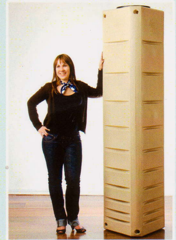
(H) 2070 x (W) 573 x (D) 500mm Capacity 360L