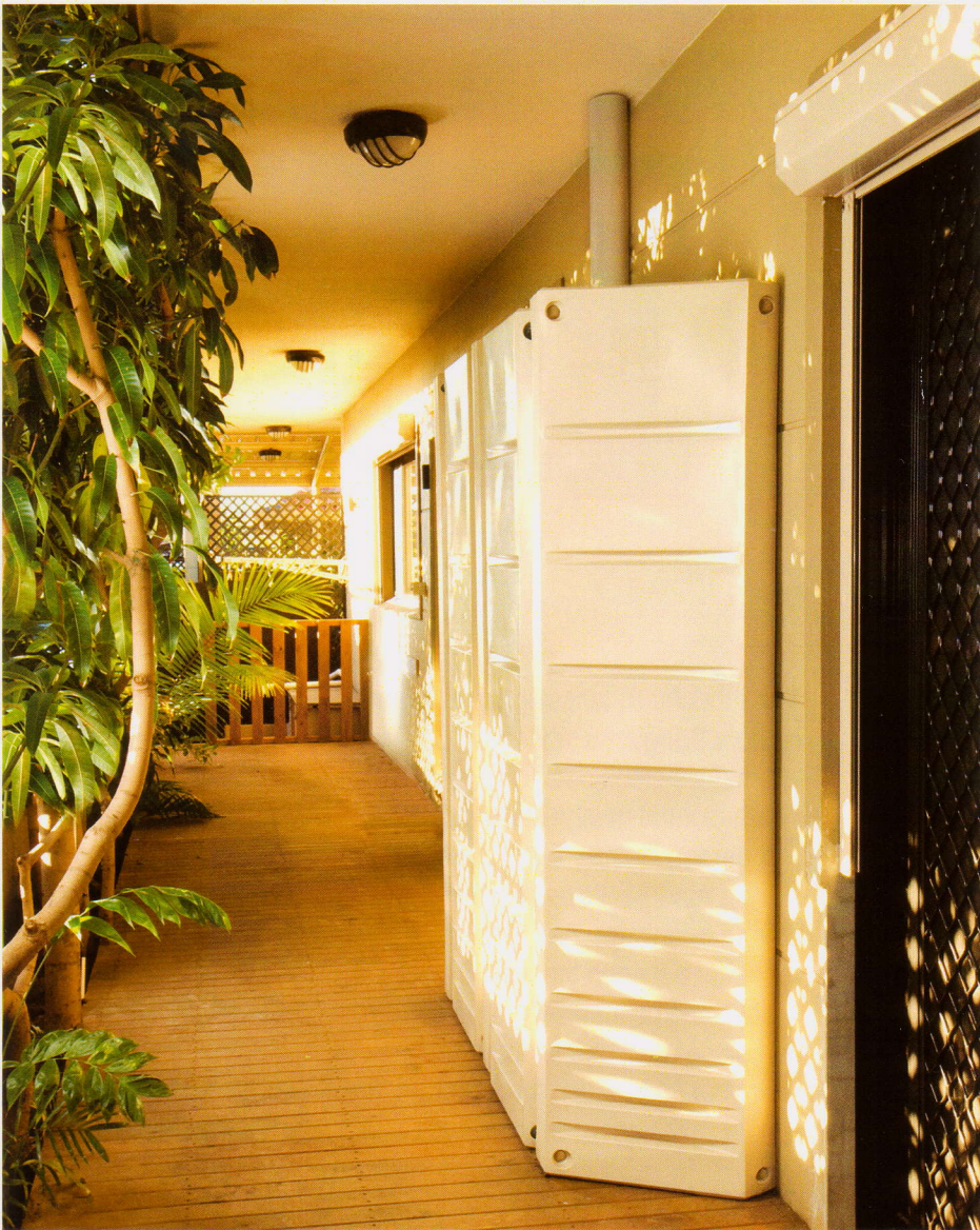
Super Slim Line Modular Tri Tank

...LEADERS IN SUPER SLIM LINE WATER TANKS