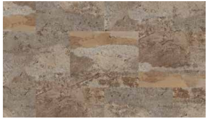
LLT206 Georgia 500mm x 610mm (19.7" x 24")