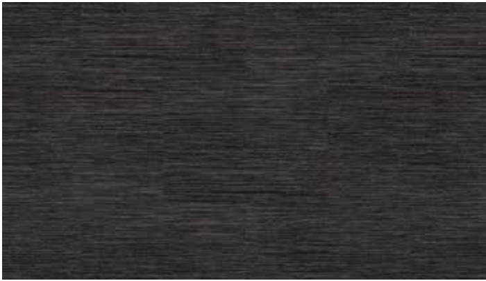
LLT205 Nevada 500mm x 610mm (19.7" x 24")