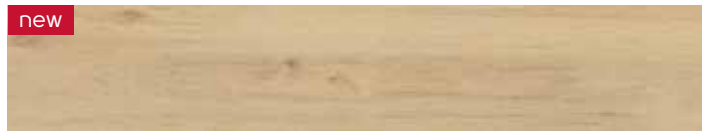
Cambridge LLP113 (Series Three) pg 22