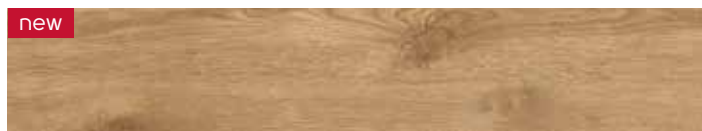
Providence LLP108 (Series Three) pg 22