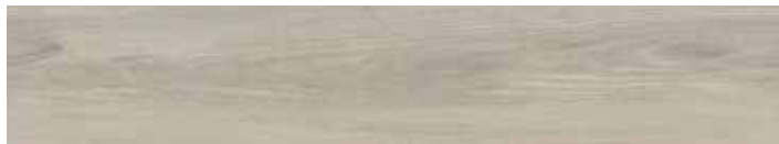
Ashland LLP95 (Series Two) pg 16