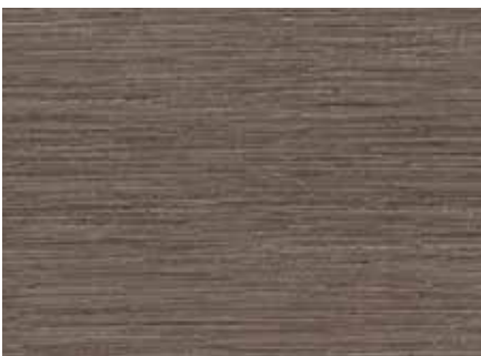
Pennsylvania LLT204 (Series Two) pg 18