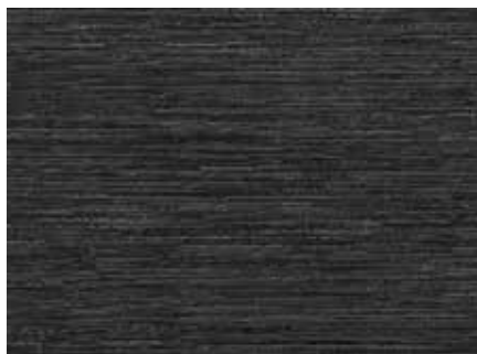
Nevada LLT205 (Series Two) pg 18