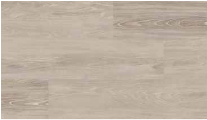
LLP95 Ashland 1050mm x 250mm (41.3" x 9.85")