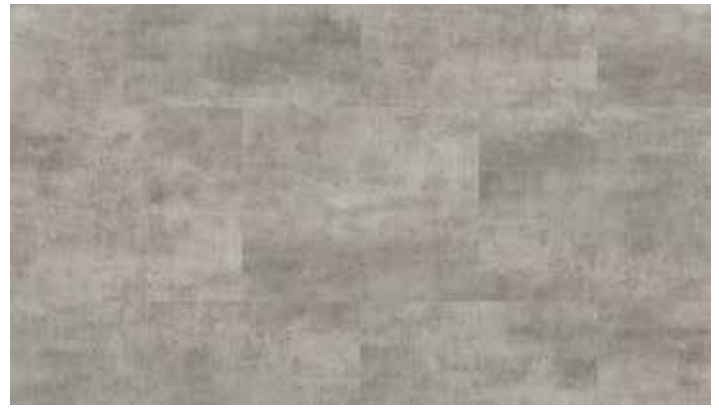
LLT201 Colorado 500mm x 610mm (19.7" x 24")