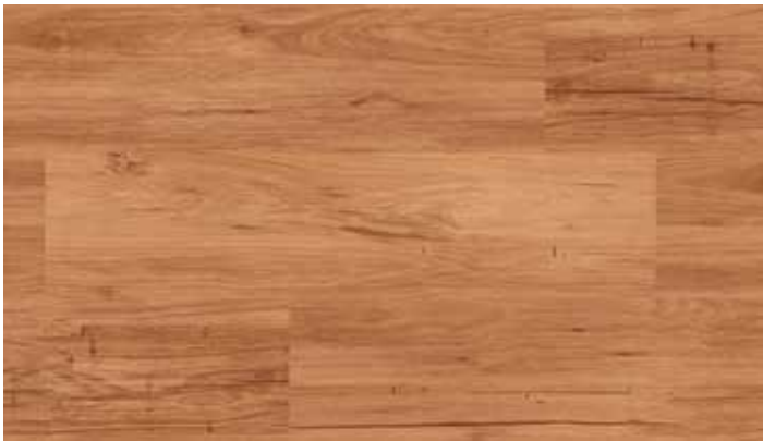
VGW39T-7LLST Antique Karri 1050mm x 250mm (41.3" x 9.85")