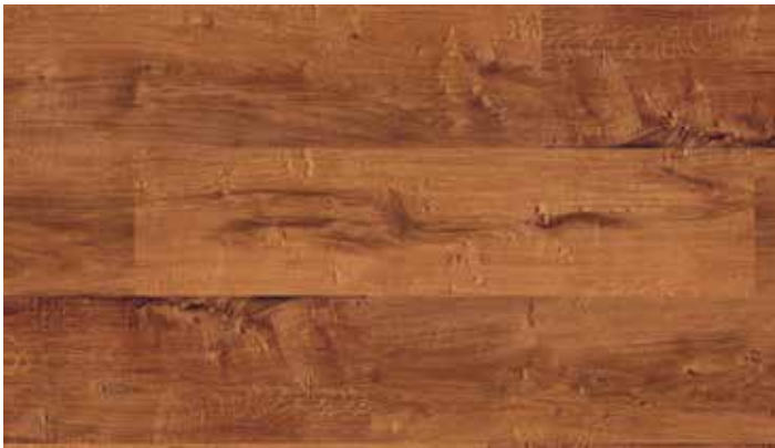
LLP97 Winchester 1050mm x 250mm (41.3" x 9.85")