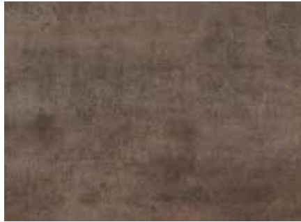
Arizona LLT200 (Series One) pg 12