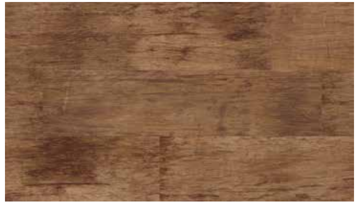
VG5-7LLST Burnt Ginger 1050mm x 250mm (41.3" x 9.85")