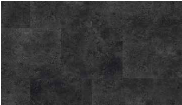
LLT203 Madison 500mm x 610mm (19.7" x 24")