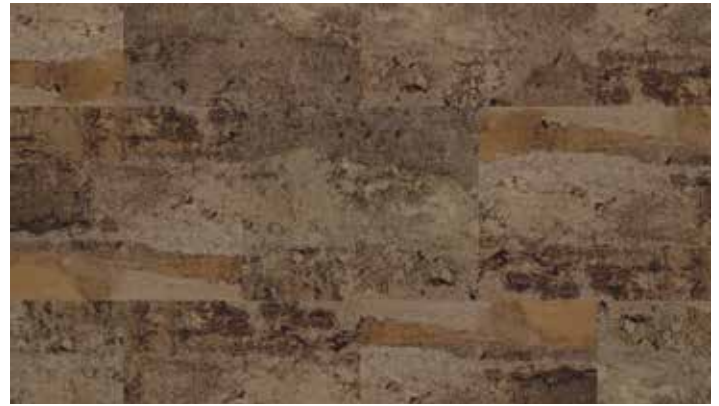
LLT207 Texas 500mm x 610mm (19.7" x 24")