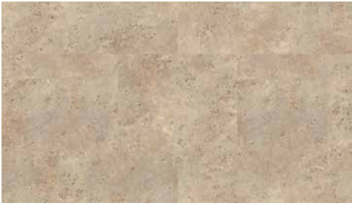
LLT202 Indiana 500mm x 610mm (19.7" x 24")