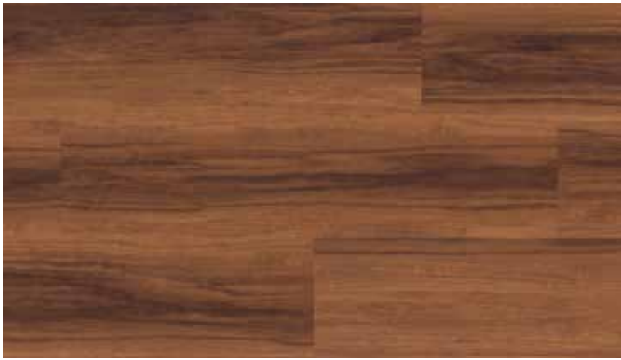
LLP110 Burlington 1050mm x 250mm (41.3" x 9.85")