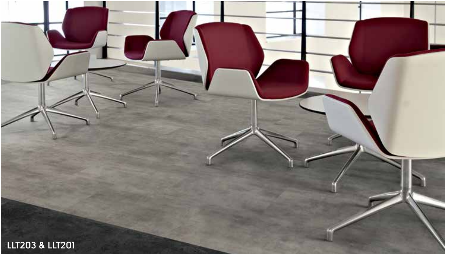
LLT203 & LLT201