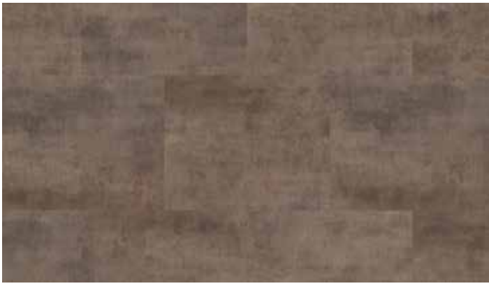
LLT200 Arizona 500mm x 610mm (19.7" x 24")