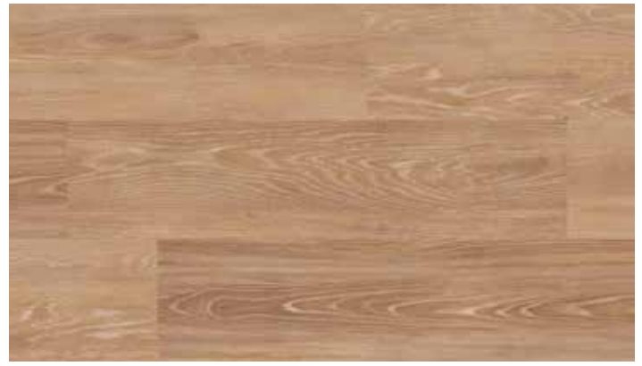
LLP94 Newport 1050mm x 250mm (41.3" x 9.85")