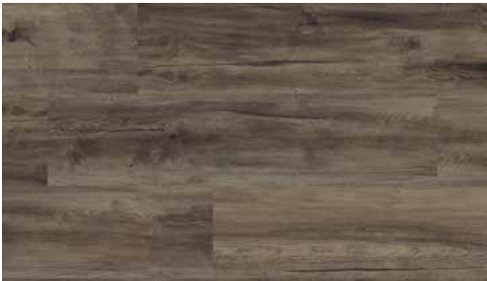
LLP112 Hartford 1050mm x 250mm (41.3" x 9.85")