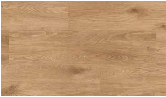
LLP108 Providence 1050mm x 250mm (41.3" x 9.85")