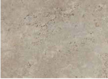
Indiana LLT202 (Series One) pg 12