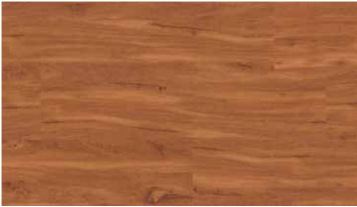
VGW33T-7LLST Copper Gum 1050mm x 250mm (41.3" x 9.85")