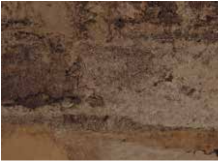
Texas LLT207 (Series Two) pg 18