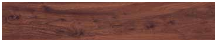
Merbau VGW91T-7LLST (Series One) pg 10