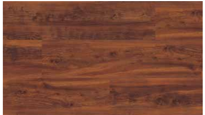
VGW91T-7LLST Merbau 1050mm x 250mm (41.3" x 9.85")