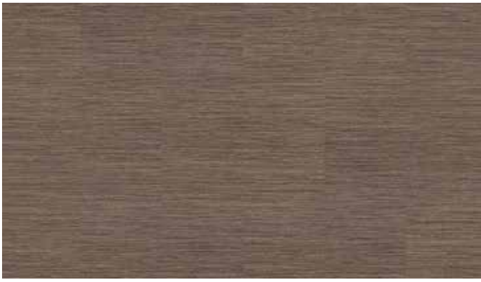
LLT204 Pennsylvania 500mm x 610mm (19.7" x 24")