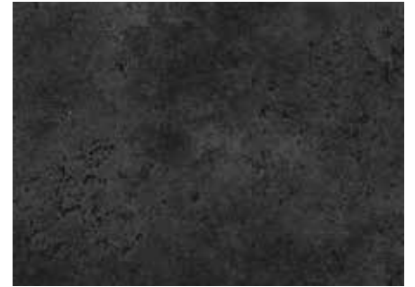
Madison LLT203 (Series One) pg 12