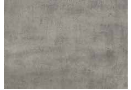
Colorado LLT201 (Series One) pg 12