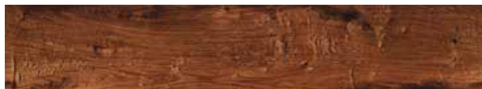
Salem LLP96 (Series Two) pg 16