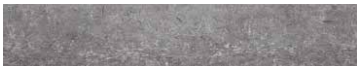
Hudson LLP99 (Series Two) pg 16