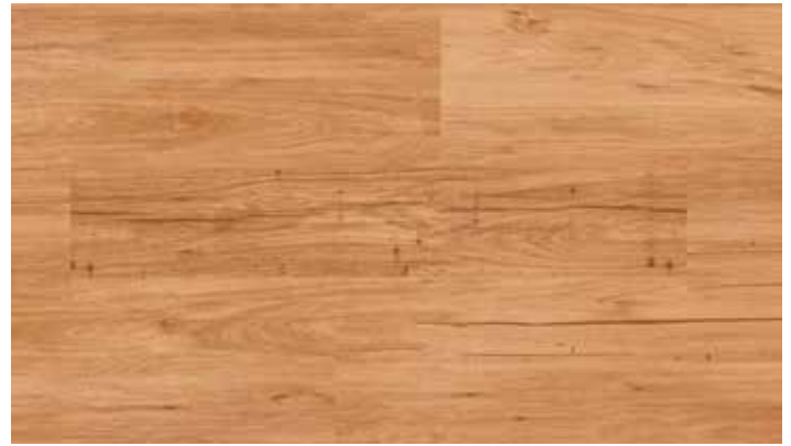
VGW38T-7LLST Tasmanian Wattle 1050mm x 250mm (41.3" x 9.85")