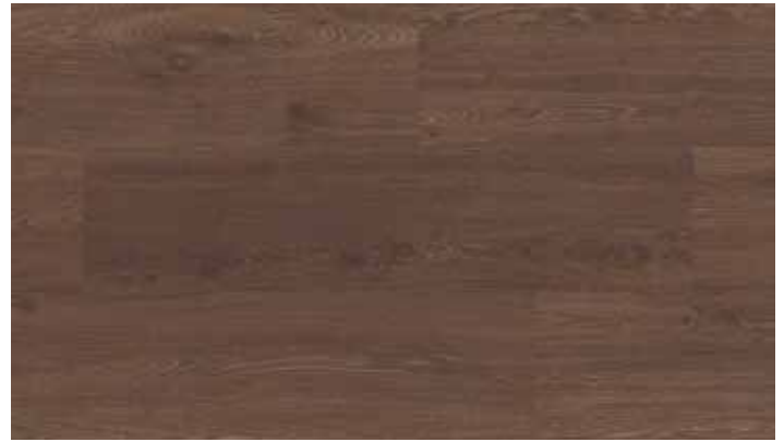
LLP111 Boston 1050mm x 250mm (41.3" x 9.85")