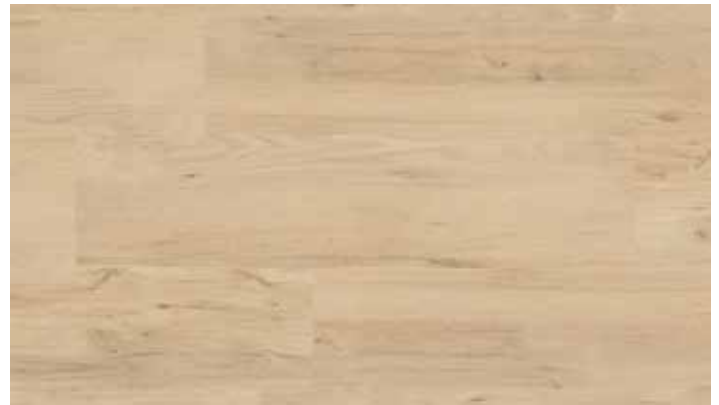
LLP113 Cambridge 1050mm x 250mm (41.3" x 9.85")