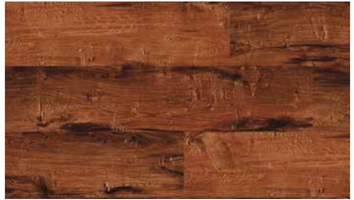
LLP96 Salem 1050mm x 250mm (41.3" x 9.85")