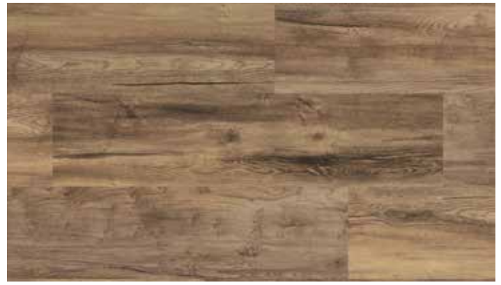
LLP109 Stamford 1050mm x 250mm (41.3" x 9.85")