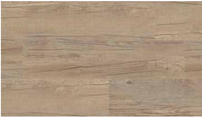
VGW92T-7LLST Country Oak 1050mm x 250mm (41.3" x 9.85")