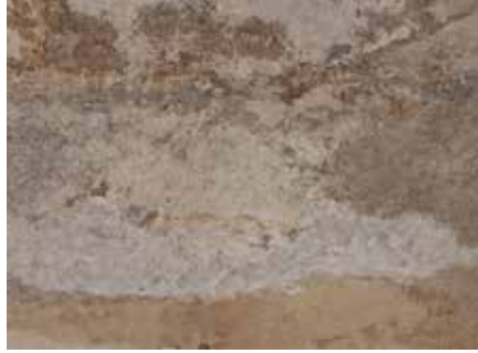
Georgia LLT206 (Series Two) pg 18