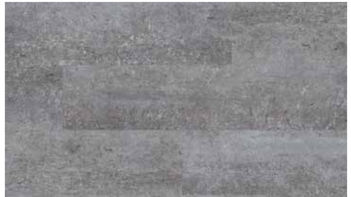
LLP99 Hudson 1050mm x 250mm (41.3" x 9.85")