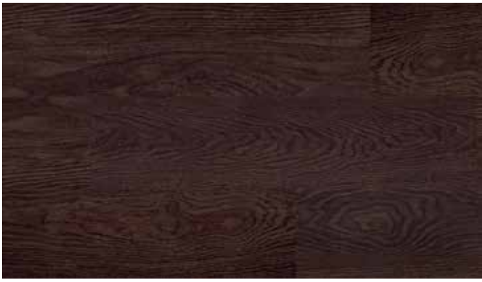
LLP93 Dover 1050mm x 250mm (41.3" x 9.85")