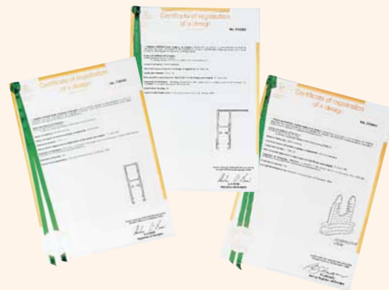
Design Certificates for Maxiblock® Shutter components