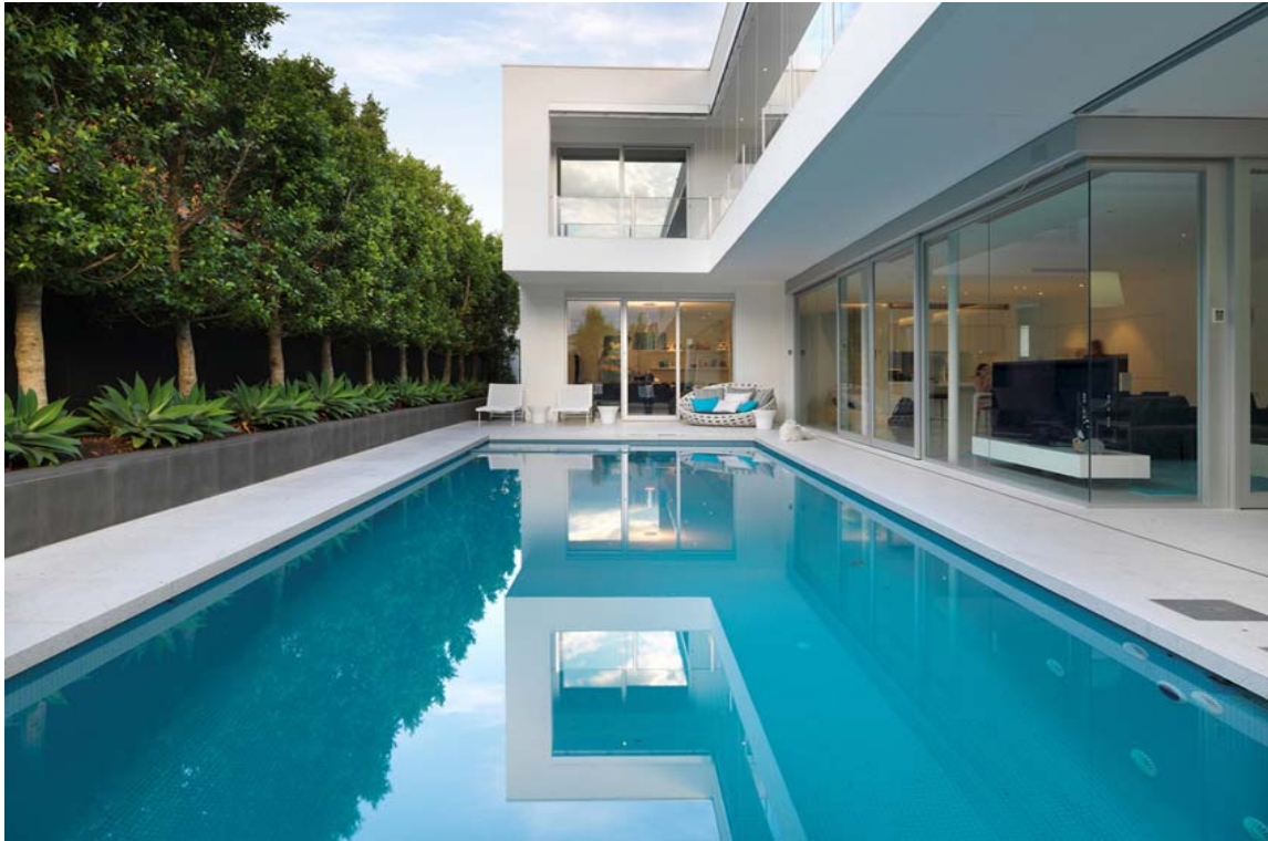
Pool House in Caulfield North by David Edelman Architects

Pool House is among the state's most exciting new architecture projects entered in this year's Australian Institute of Architects' Victorian Architecture Awards .