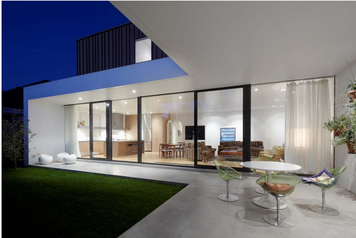
Hopetoun Street in Elsternwick by b.e architecture

Hopetoun Street is among the state’s most exciting new architecture projects entered in this year’s Australian Institute of Architects’ Victorian Architecture Awards .