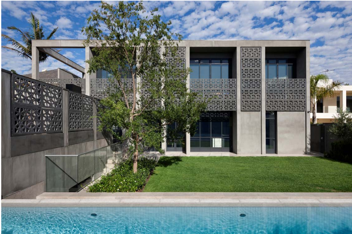
Brighton House in Brighton by Buro architects

Brighton House is among the state's most exciting new architecture projects entered in this year's Australian Institute of Architects' Victorian Architecture Awards .