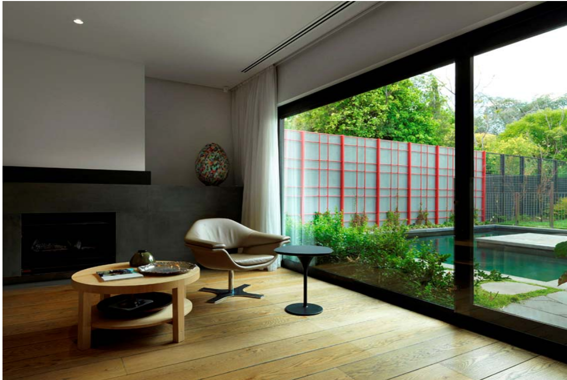
Gallery House in Caulfield North by David Edelman Architects

Gallery House is among the state's most exciting new architecture projects entered in this year's Australian Institute of Architects' Victorian Architecture Awards .