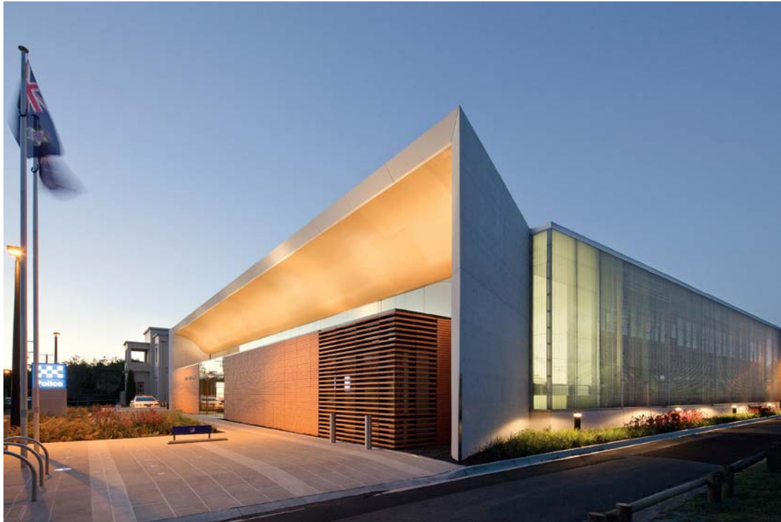
Bayside Police Station in Sandringham by fjmt (Francis-Jones Morehen Thorp)

Bayside Police Station is among the state's most exciting new architecture projects entered in this year's Australian Institute of Architects' Victorian Architecture Awards .