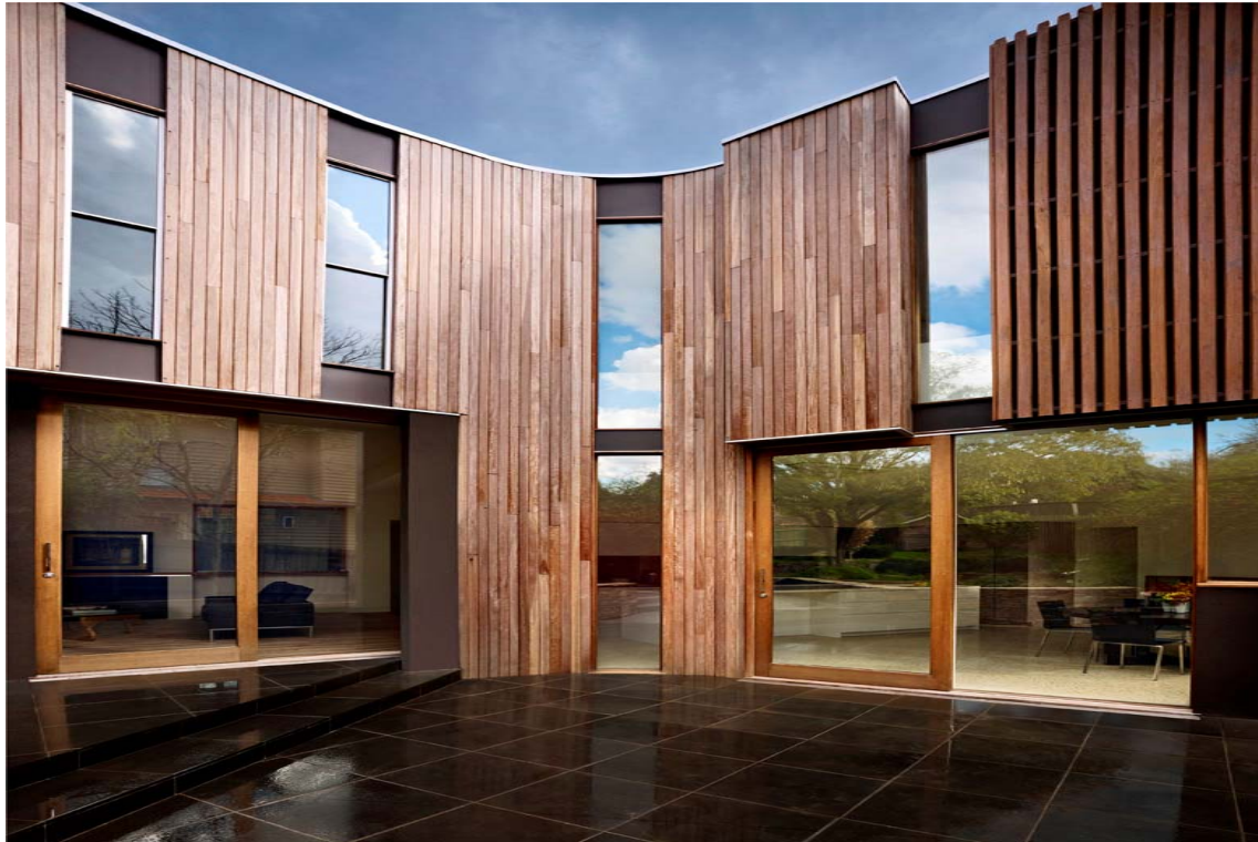
Glen Iris House in Glen Iris by Steffen Welsch Architects

Glen Iris House is among the state’s most exciting new architecture projects entered in this year’s Australian Institute of Architects’ Victorian Architecture Awards .