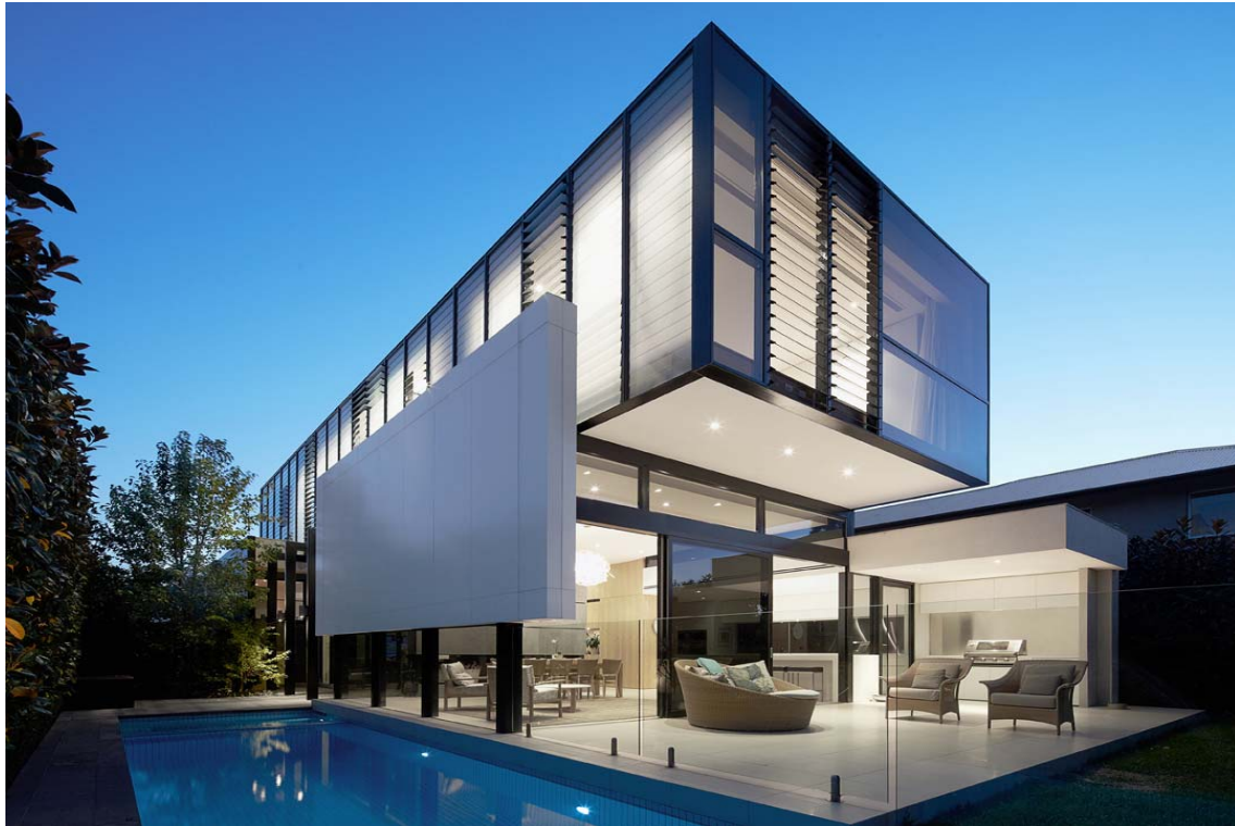
Good House in Sandringham by Crone Partners

Good House is among the state’s most exciting new architecture projects entered in this year’s Australian Institute of Architects’ Victorian Architecture Awards .