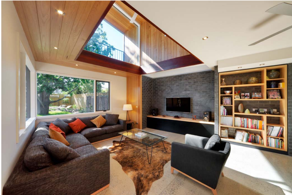
Liquid Amber in East Brighton by Zen Architects

Liquid Amber is among the state’s most exciting new architecture projects entered in this year’s Australian Institute of Architects’ Victorian Architecture Awards .