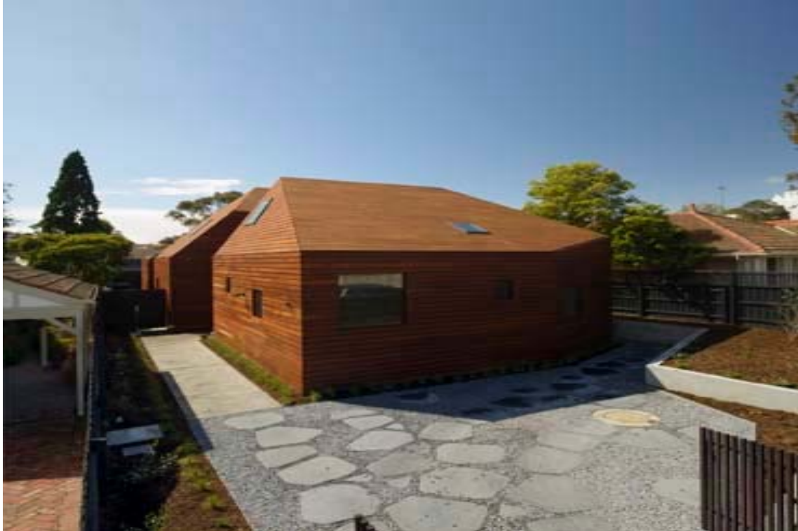
Hampton Residence in Hampton by Jackson Clements Burrows Architects

Hampton Residence is among the state's most exciting new architecture projects entered in this year's Australian Institute of Architects' Victorian Architecture Awards .