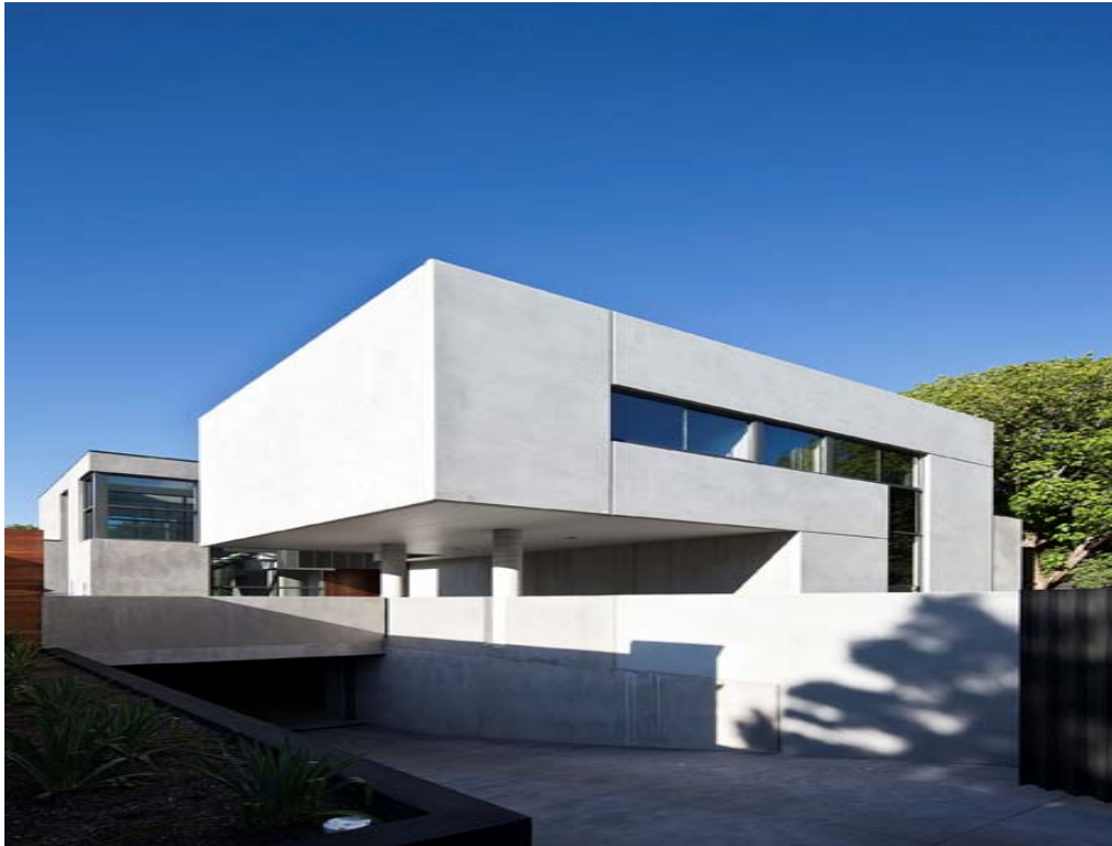
Cosham House in Brighton by Peddle Thorp Architects

Cosham House is among the state's most exciting new architecture projects entered in this year's Australian Institute of Architects' Victorian Architecture Awards .