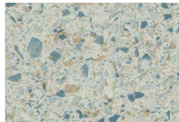
Maraca | CH2855U