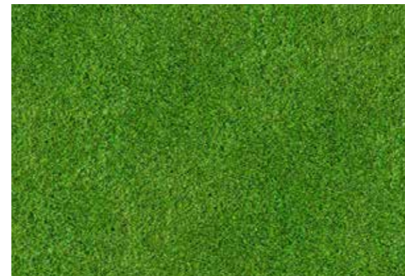
Grass 1 | DPSCH0059