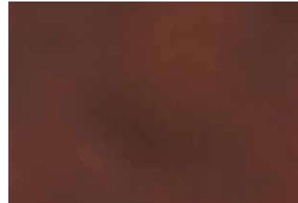
Antique Copper | 9912