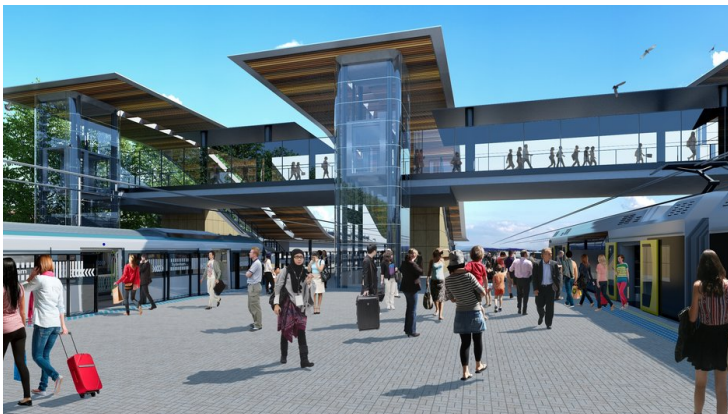
Artist Impression of Sydenham Station

Delivering successful outcomes for this stage of Sydney Metro provided project partners with a high degree of confidence resulting in Weldlok being awarded the next stage at Marrickville Metro.