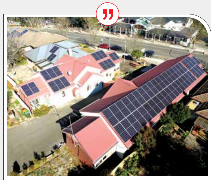
Echo Point Village, Katoomba, NSW

The installed solar systems now provide consistent onsite power generation helping Equeva offset the heavy daytime demand of this busy hotel group. By going solar across these sites with LONGi solar panels the hotel owners are saving over $70,000 AUD per year.