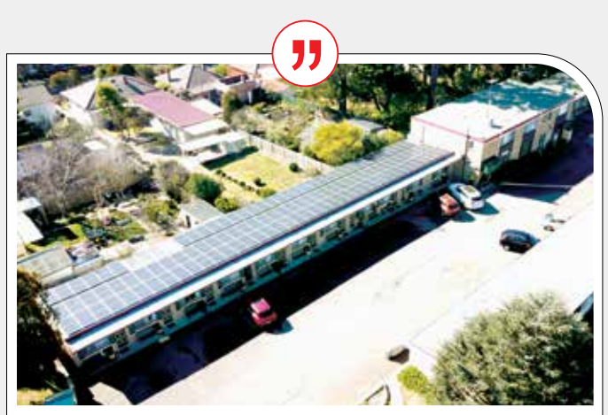
Echo Point Motel, Katoomba, NSW

Working with the knowledgeable and professional installers at My Energy Group, Equeva selected LONGi solar panels to reduce their carbon footprint, showcase the ecofriendly vision of the hotel group and save money.