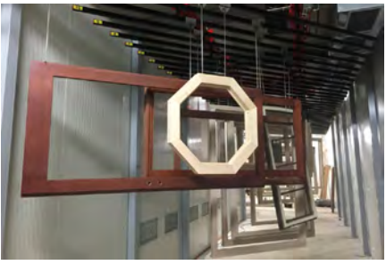
Warmer in winter