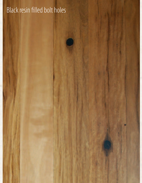
Black resin filled bolt holes

Some common applications, both structural and decorative include: bench and bar tops, posts and beams, seating, and stair treads.