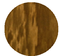
SPOTTED GUM STAIN