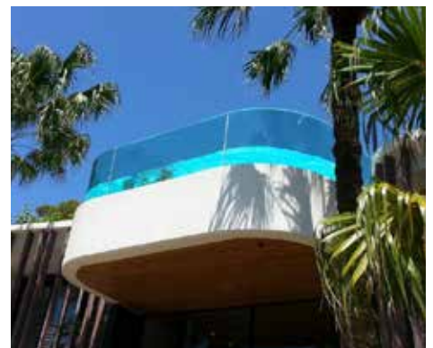
54.84mm clear toughened structural laminated curved and flat glass pool wet edge