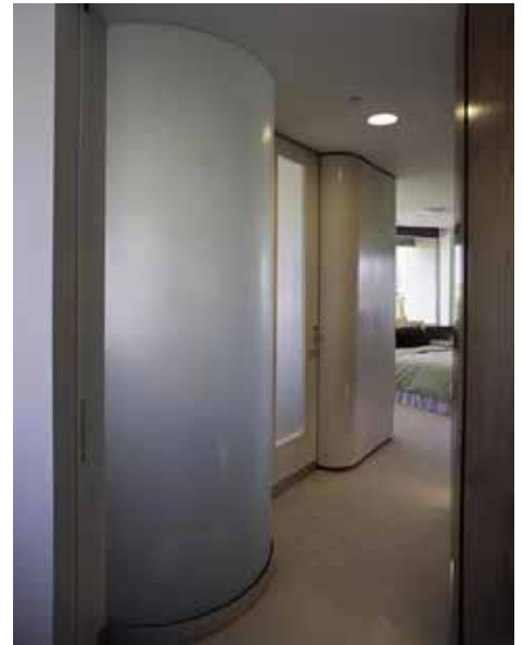
10mm clear toughened curved glass shower with applied frosted film