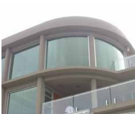
16.76mm clear laminated curved & flat glass fixed window facade