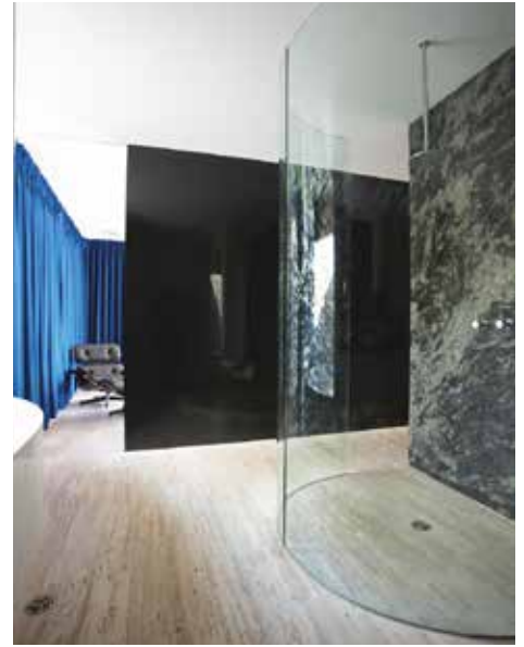
12mm clear toughened curved glass shower enclosure