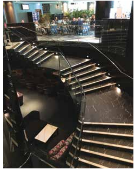
25.25mm toughened laminated curved glass balustrade