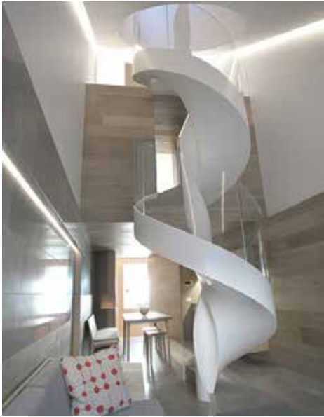
15.04mm low iron toughened structural laminated curved and flat glass balustrade Engineered for compliance without handrail