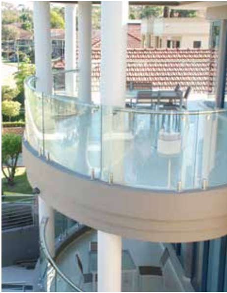
12mm clear toughened curved glass frameless cantilever balustrade panels