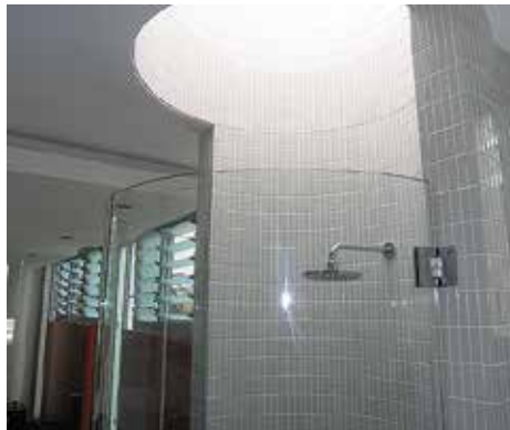
8mm clear toughened curved glass frameless glass in glazing channel at floor level