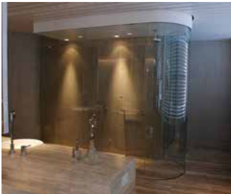
8mm clear toughened curved and flat glass shower enclosure