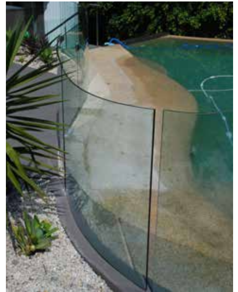
12mm clear shapecut toughened curved. Non shrink grout fixing into rebate in concrete retaining wall