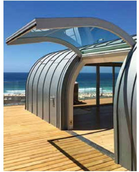
16.76mm clear laminated curved glass gullwing door