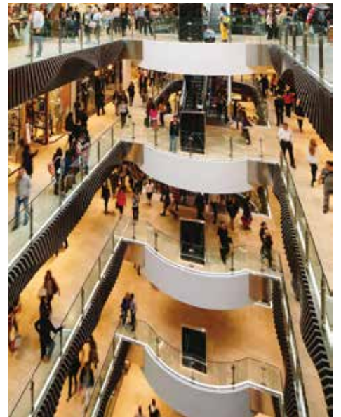
21.52mm clear toughened structural laminated frameless curved glass balustrade