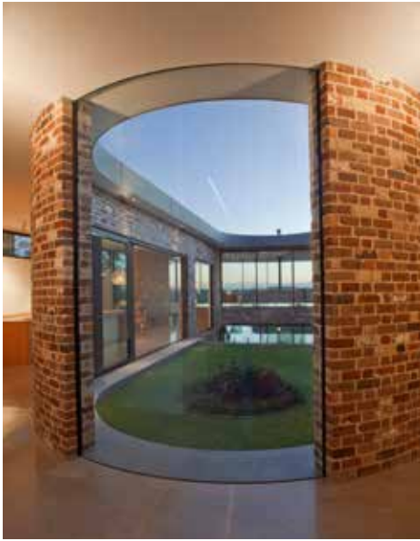
12.76mm clear annealed Low E laminated curved glass window internal view