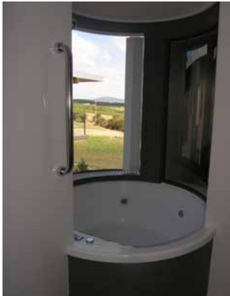
6mm clear toughened curved glass shower enclosure