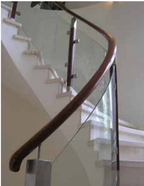
10mm clear toughened & 11mm clear laminated curved glass cantilever frameless stair panels