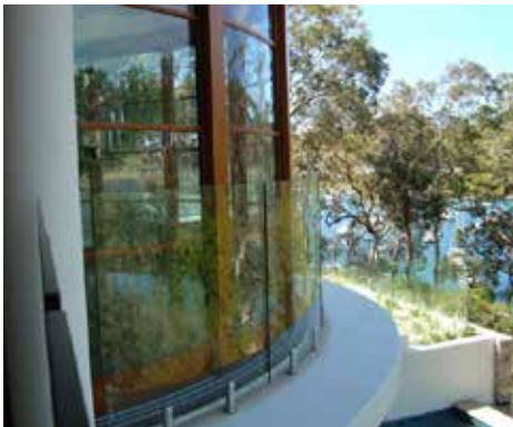
12mm clear toughened curved glass balustrade