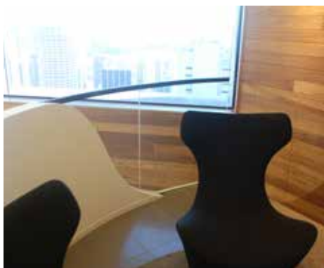
15.04mm clear toughened structural laminated curved glass balustrade