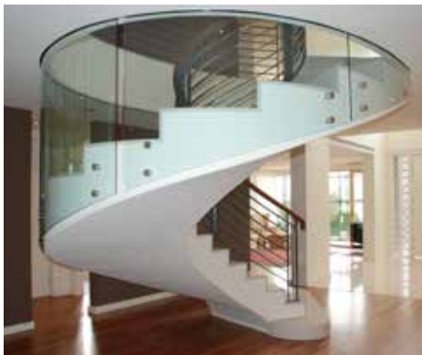
10mm clear toughened curved glass staircase