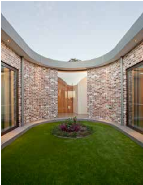
12.76mm clear annealed Low E laminated curved glass window external view