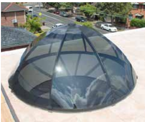
11.76mm grey Low E annealed laminated curved glass roof dome external view