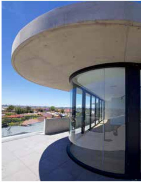
10mm clear toughened curved glass window facade