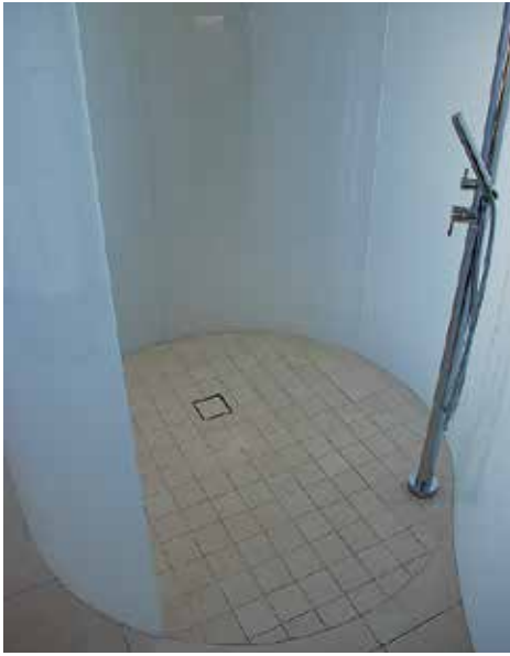
12.76mm starphire white translucent laminated curved glass inside view