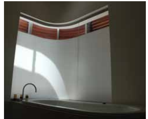
11mm clear laminated curved glass bathroom window with applied privacy film