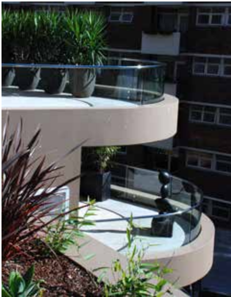
12mm clear toughened curved glass sided fixed balustrade