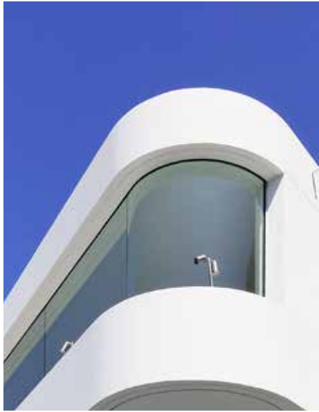
11.76mm clear pvb laminated curved glass window