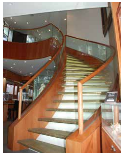
Levendi Jewellery toughened curved glass balustrade panels