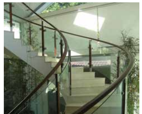
12mm clear toughened curved glass stair balustrade panels cantilever frameless panels with standoff fittings