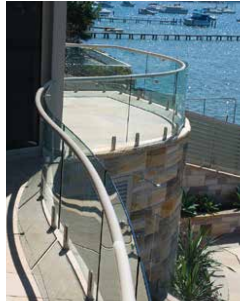
12mm clear toughened curved glass frameless cantilever balustrade panels