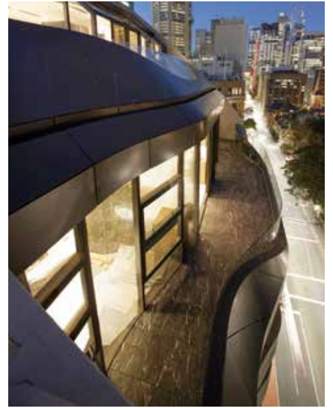
15.04mm clear toughened structural laminated curved and flat glass balustrade Engineered for compliance without a top rail