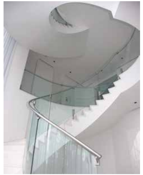
10mm clear toughened curved glass infill panels