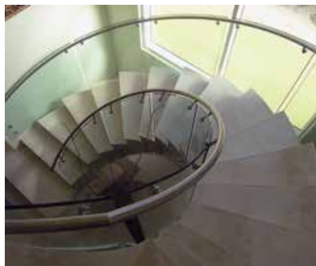
12mm clear toughened curved glass panels cantilever frameless panels with standoff patch fittings