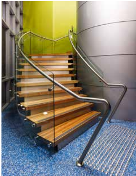
12mm clear toughened curved glass stair balustrade side fixed to timber stair treads