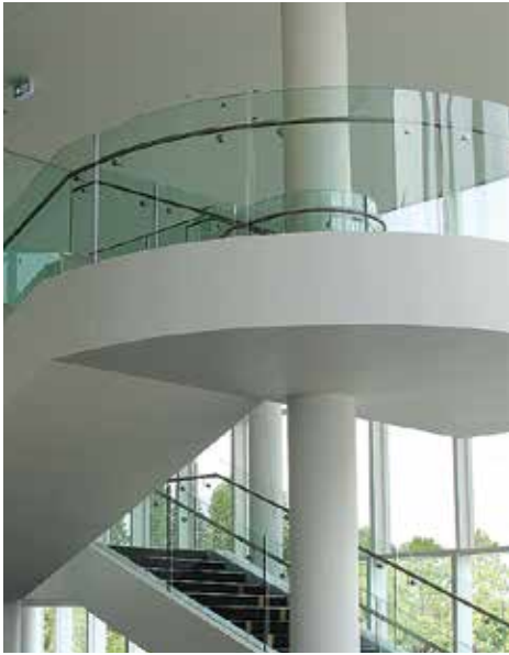
17.52mm clear toughened laminated curved glass balustrade