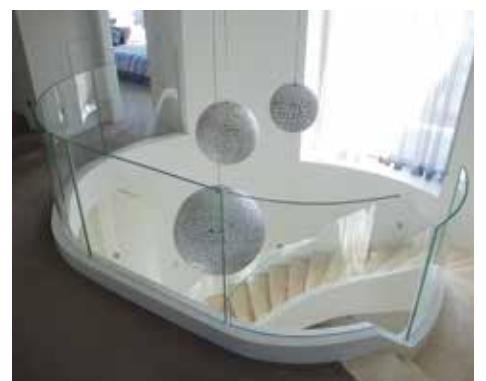
15.04mm Starphine toughened structural laminated curved glass balustrade. Engineered for compliance without a top rail