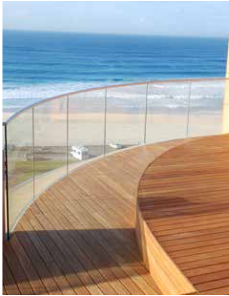
15mm clear toughened heat soaked curved glass balustrade