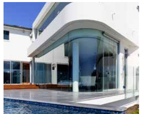
14.76mm clear pvb laminated curved glass window