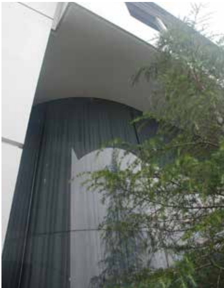
12.76mm grey tinted laminated curved and flat glass