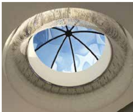
11.76mm grey Low E annealed laminated curved glass roof dome internal view