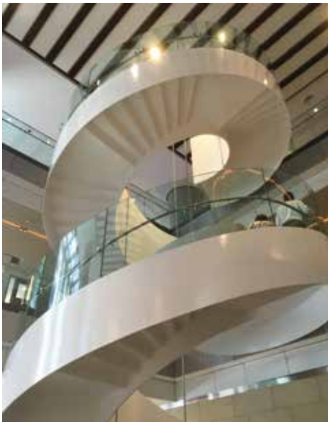
21.52mm clear heat strengthened laminated curved and flat glass