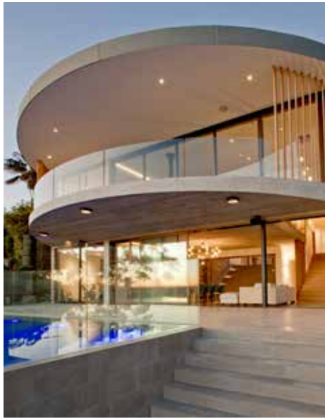
15.04mm clear toughened structural laminated curved glass balustrade Engineered for compliance without a top rail