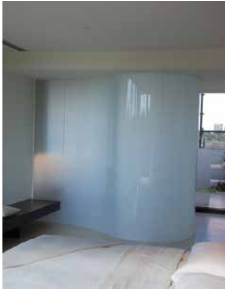
12.76mm starphire white translucent laminated curved glass outside view