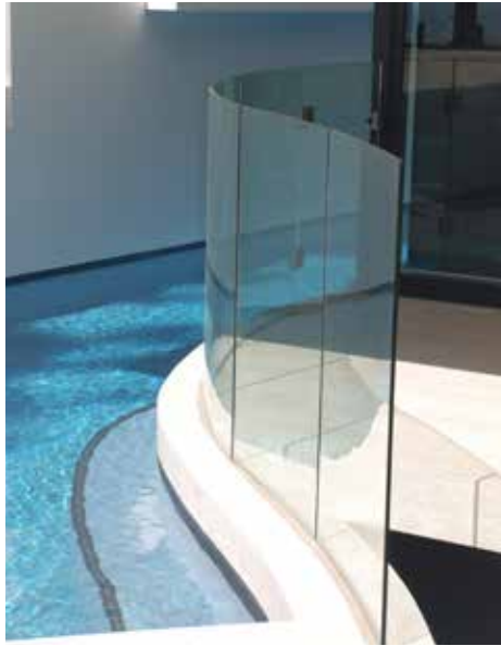
12mm clear toughened curved glass frameless, Non shrink grout fixing into concrete slab