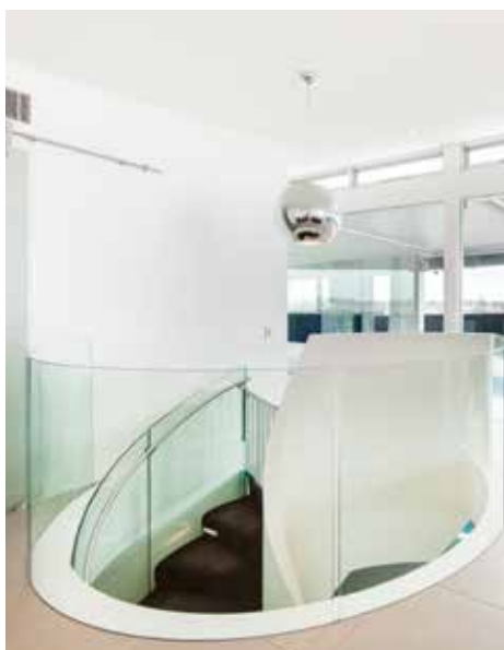
15.04mm clear toughened structural laminated curved glass balustrade Engineered for compliance without a top rail