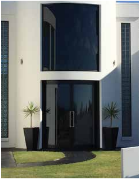
24mm grey toughened double glazed curved glass door units