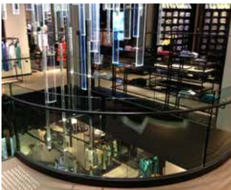
21.52mm clear toughened laminated curved glass balustrade