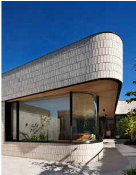
laminated low E curved glass window