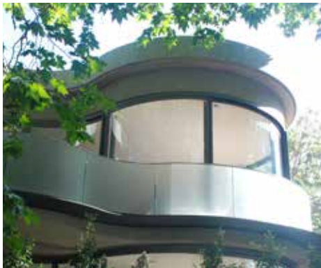
12mm Matelux acid etched toughened curved glass balustrade