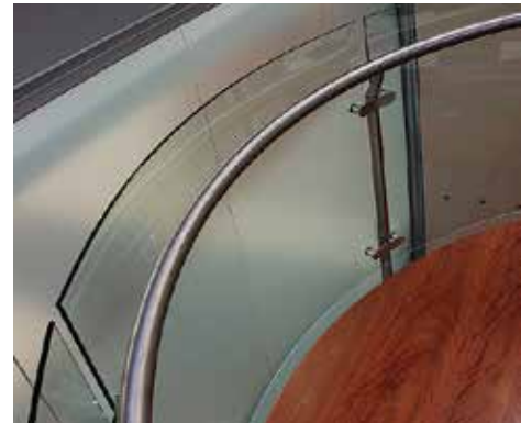
10mm clear toughened curved glass balustrade