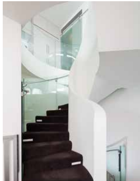
12mm clear toughened curved glass stair balustrade