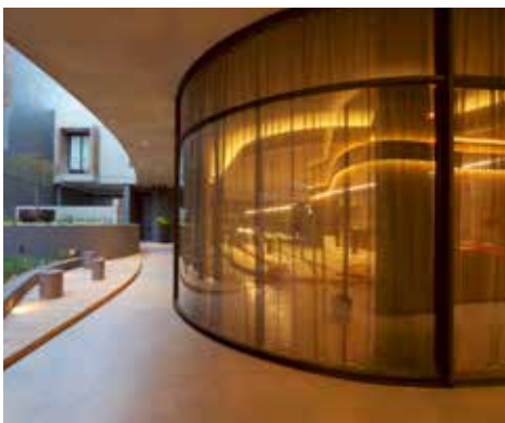
6mm and 12mm clear toughened curved glass window facade