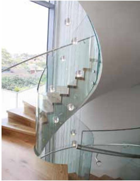
Inner balustrade: 15.04mm clear toughened structural laminated curved glass Engineered for compliance without handrail