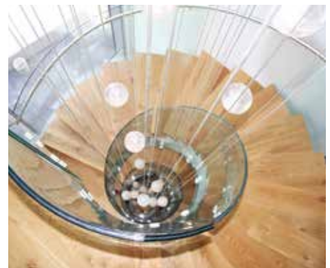
Inner balustrade: 15.04mm clear toughened structural laminated curved glass Engineered for compliance without handrail