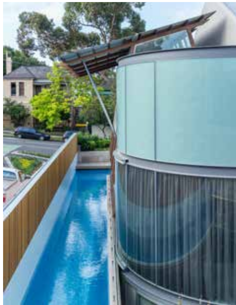
Upper level: 13.14mm white translucent clear low E laminated curved glass Lower level: 12.76mm clear laminated curved glass