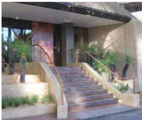
12mm clear toughened curved glass balustrade