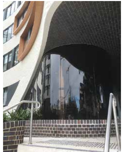
12 mm bronze tinted toughened curved glass window facade