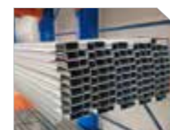
STUDTEK Steel Sub-framing