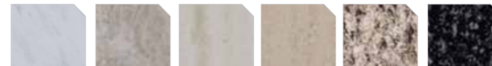
UC6060 Marble Pearl White UC6385 Marble Cashmir Beige UC6315 Travertine Atlas Beige UC6305 Travertine Calico Cream UC6310 Granite Aurisina Beige UC6280 Granite Magenite Black