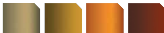
UC7160 Chromatic Antique Gold UC7170 Chromatic Honey Gold UC7180 Chromatic Tiger Orange UC7190 Chromatic Sahara Copper