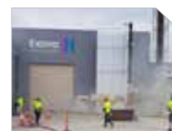
FIRESPAN AS 1530.1 Sarking