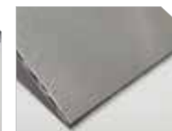
ULTRACORE Sparkling Colours