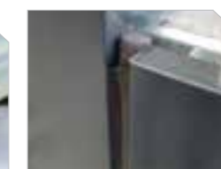
JOINT SEALANT Prolastik & Sikaflex