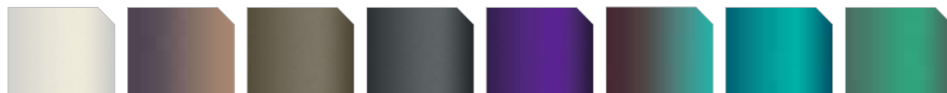
UC7090 Chromatic Golden Snow UC7430 Chromatic Sunset Purple UC7350 Chromatic Rustic Bronze UC7290 Chromatic Galaxy Silver UC7480 Chromatic Indigo Violet UC7450 Chromatic Oriental Silk UC7490 Chromatic Tropical Ocean UC7510 Chromatic Martian Green