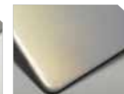
ULTRACORE Chromatic Colours