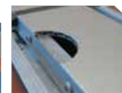
EXTRUSIONS Z-angles & Trims