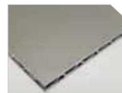
ULTRACORE Metallic Colours