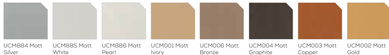
UCM884 Matt Silver UCM885 Matt White UCM886 Matt Pearl UCM001 Matt Ivory UCM006 Matt Bronze UCM004 Matt Graphite UCM003 Matt Copper UCM002 Matt Gold