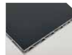
ULTRACORE Solid / Matt Colours