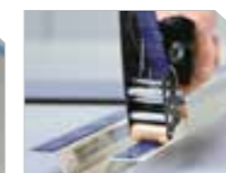
TAPES & GASKETS Foil & Foam Tapes