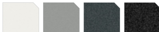
UC7010 Sparkling White Gloss UC4725 Sparkling Light Grey UC7250 Sparkling Dark Grey UC7295 Sparkling Black Gloss