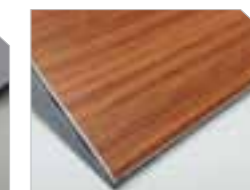
ULTRACORE Imitation Finishes