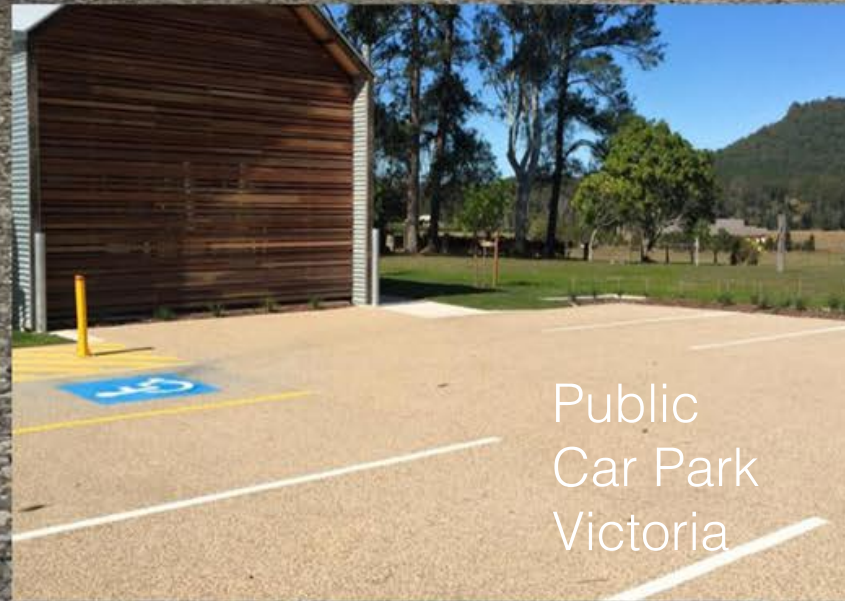
Public Car Park Victoria