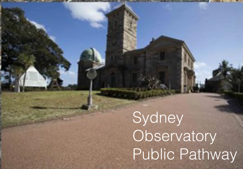
Sydney Observatory Public Pathway

StoneSet has benefited many homeowners -