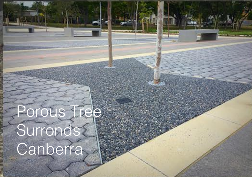
Porous Tree Surrounds Canberra