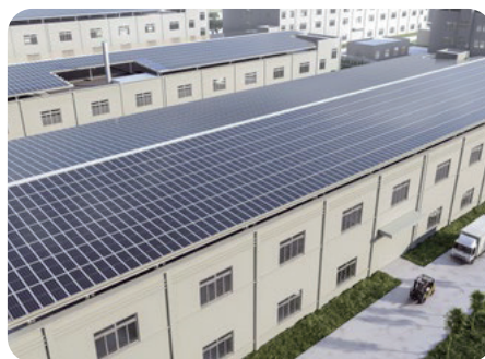
Flat-to-pitched Roof Conversion