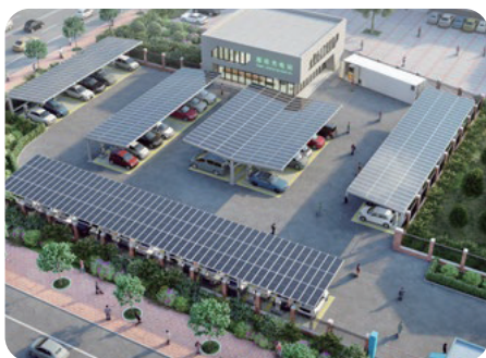
Solar-plus-storage and EV Charging Carport