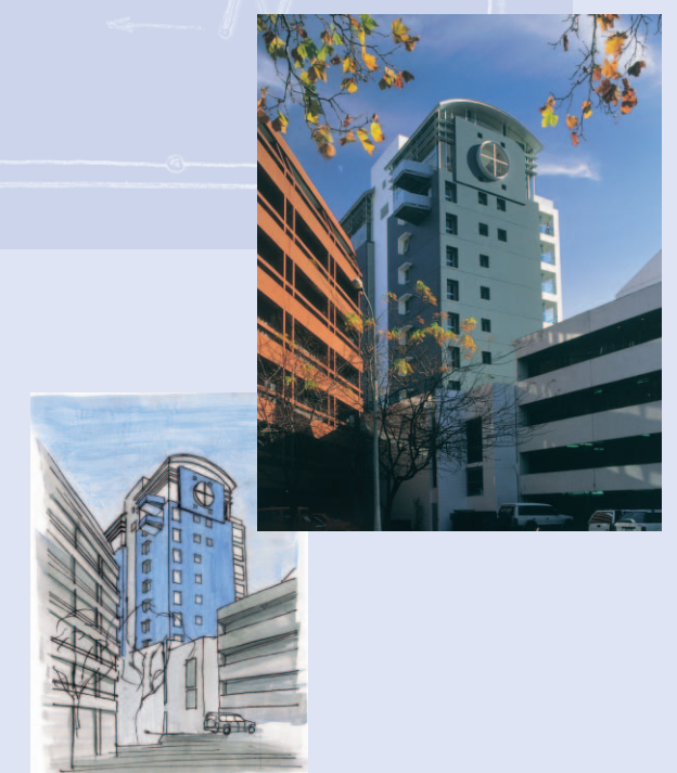
Architect: Warren & Mahoney

Our internationally recognised quality systems and ISO 9001 accreditation allow us to guarantee our products for consistency and performance, so Resene quality is assured - every step of the way.