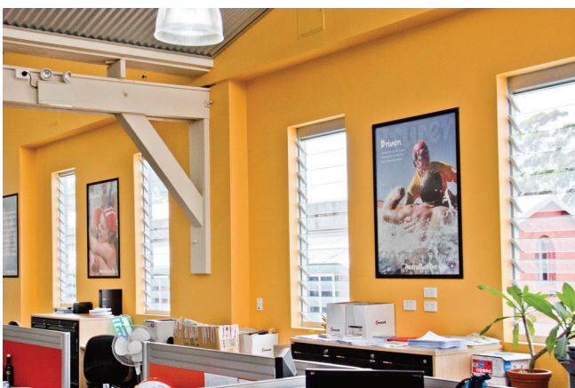
Surf Life Saving Australia Headquarters: Altair Louvres reduce the reliance on air conditioning in an office environment.

While double glazing can give lower U-values than monolithic glass with a low e coating, in many cases double glazed windows have higher (worse) U-values than monolithic glass with a low e coating.