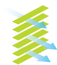
Altair Louvre Windows

90% fresh air regardless of wind direction