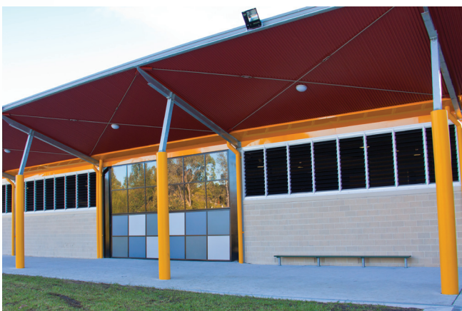
St Paul's Grammar School: Altair Powerlouvres control airflow into school buildings to help stimulate young minds.

"Energy savings for a mixed mode (hybrid) system are on average 59%."