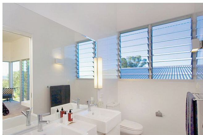
Karinya Residential Home: Altair Louvres maximise natural light and ventilation in residential applications.