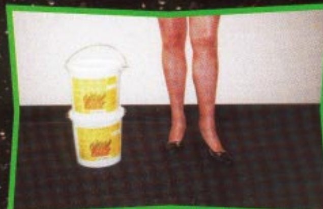
easy on backs and knees