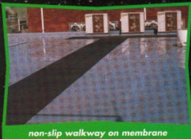
non-slip walkway on membrane