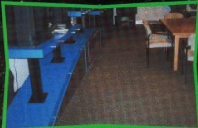
hard-wearing comfortable showroom floor