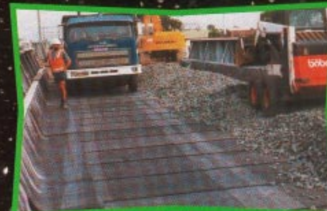
under ballast on rail bridges