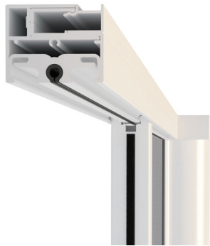
■ Top Track