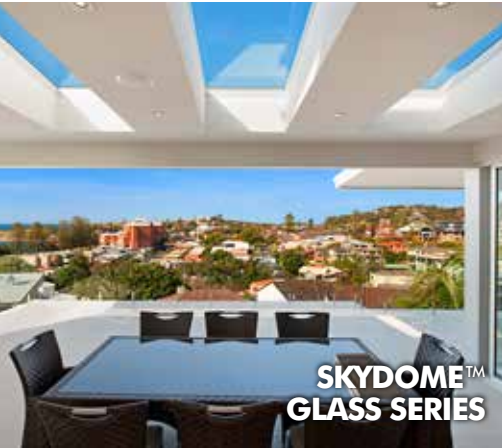
SKYDOME™ GLASS SERIES