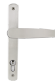
DS1500 #5 Swan French Door Furniture