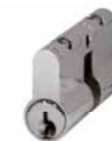
DS1272 Euro Cylinder 5 Pin