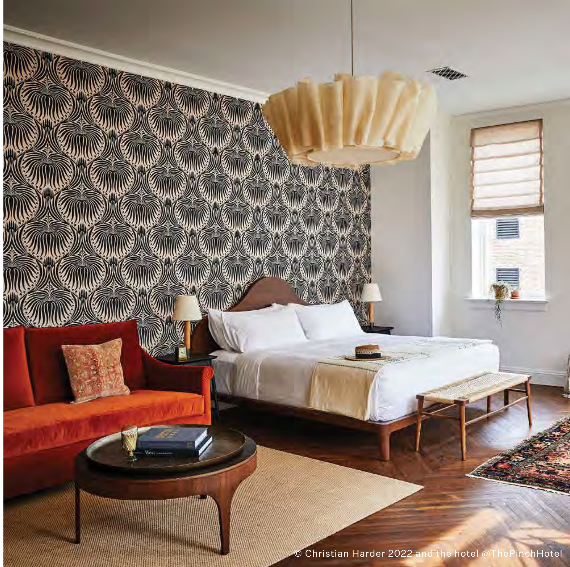
© Christian Harder 2022 and the hotel @ThePinchHotel