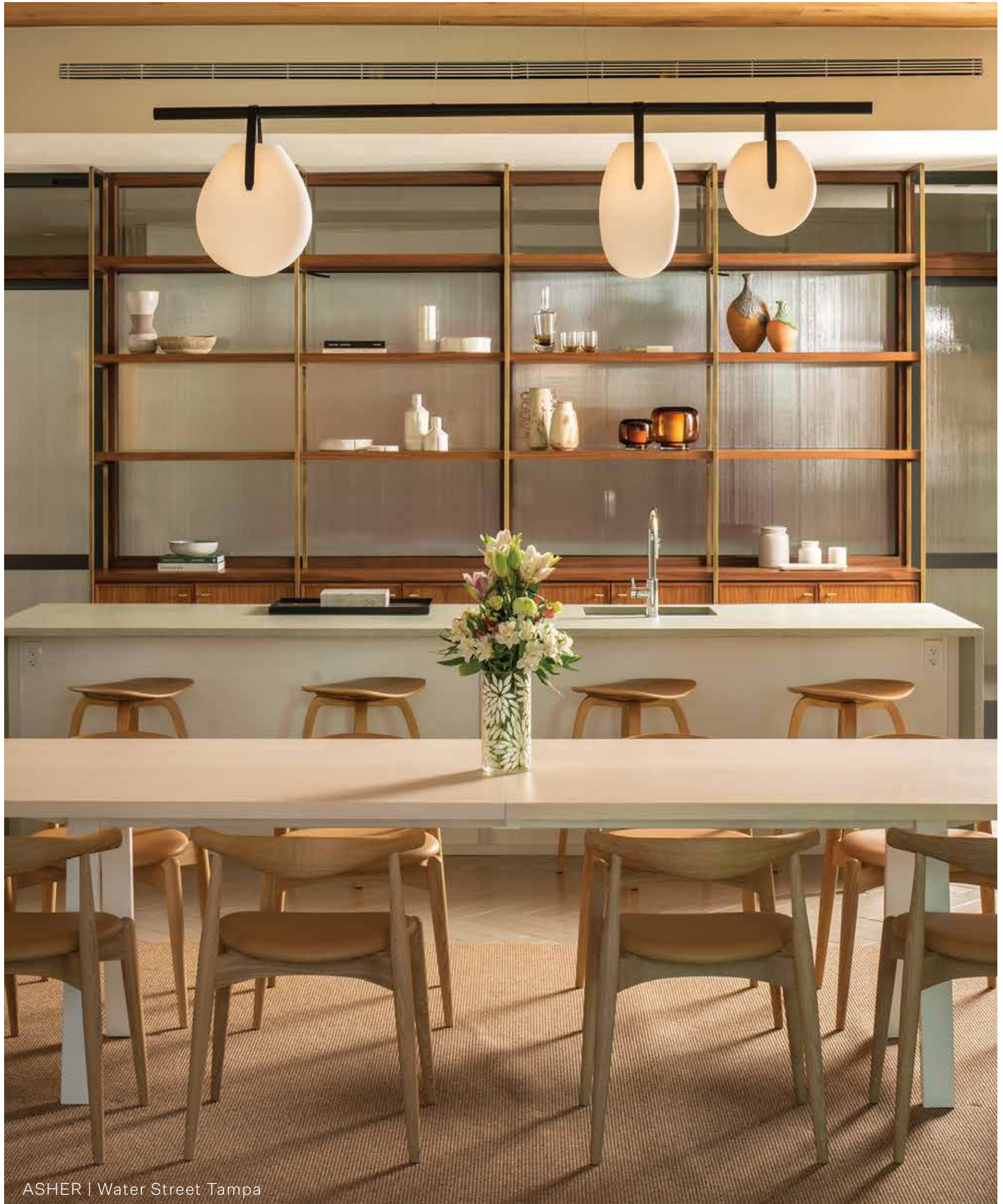
ASHER | Water Street Tampa