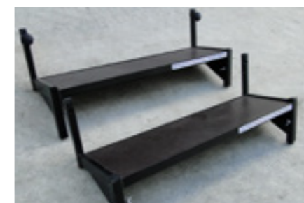
Safety Modular Steps