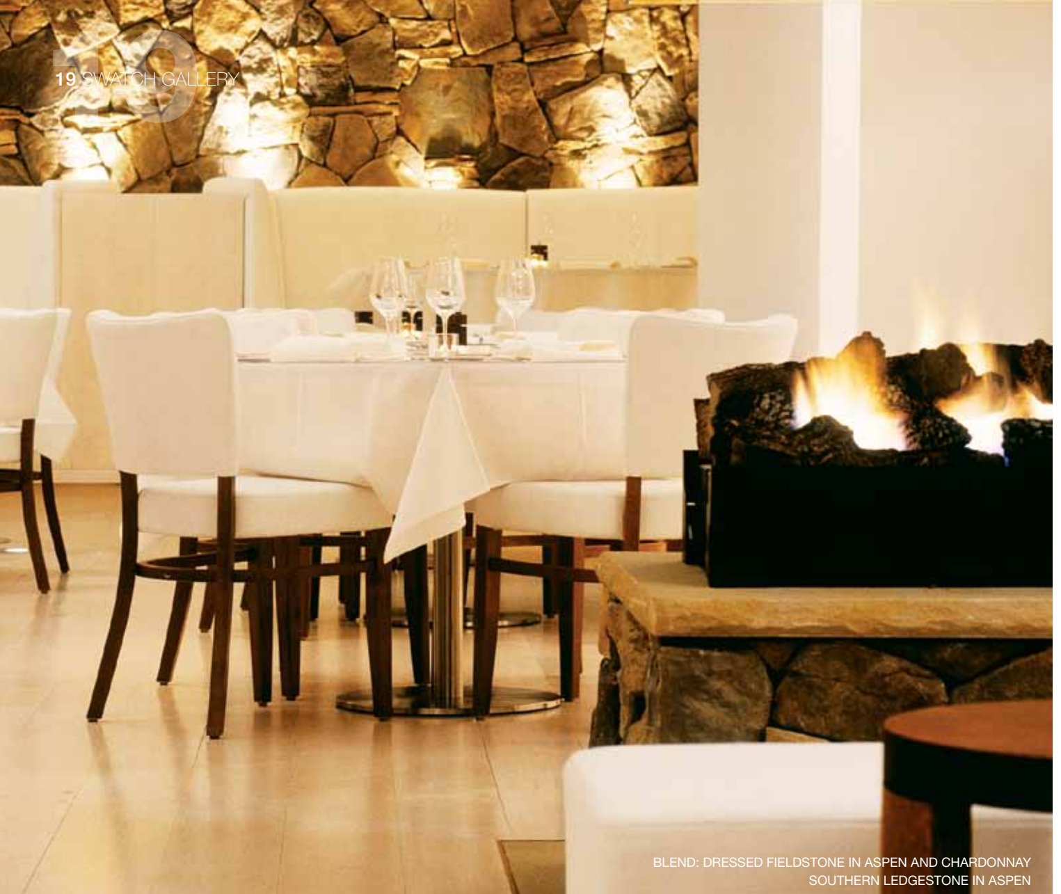
BLEND: DRESSED FIELDSTONE IN ASPEN AND CHARDONNAY SOUTHERN LEDGESTONE IN ASPEN