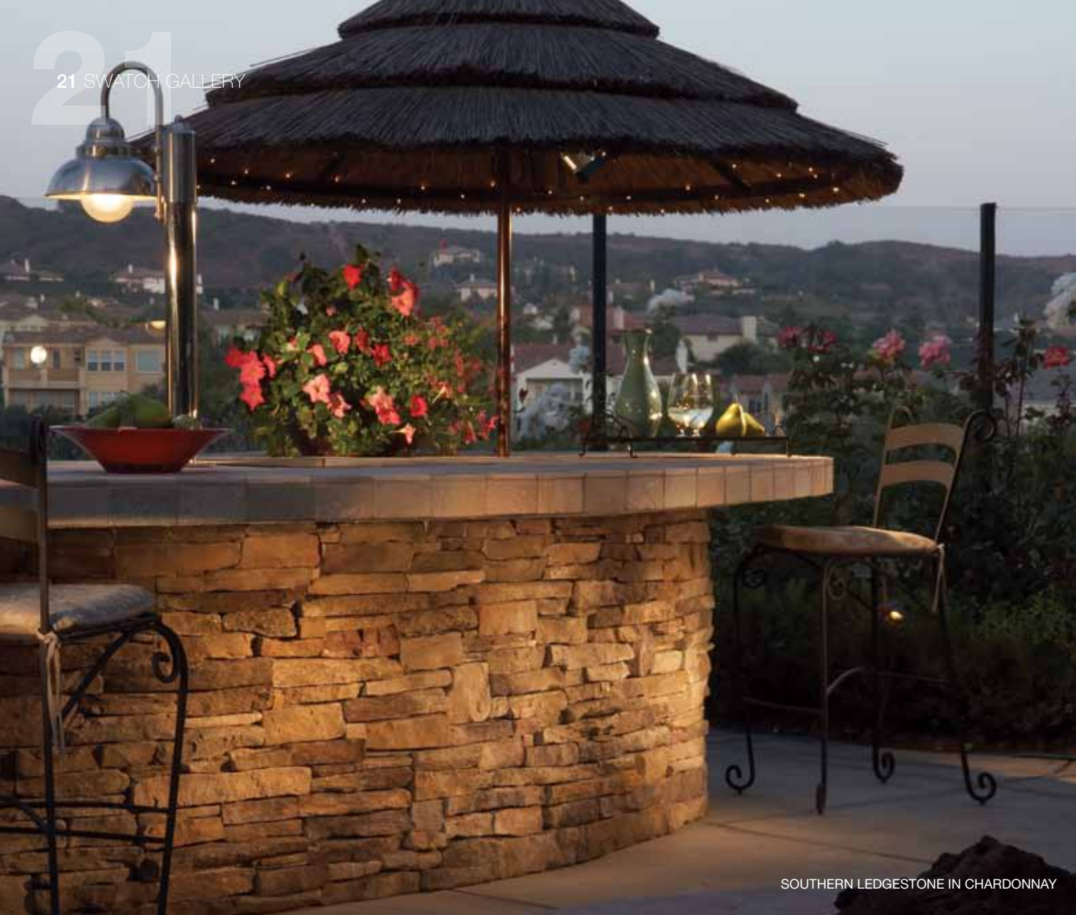
SOUTHERN LEDGESTONE IN CHARDONNAY