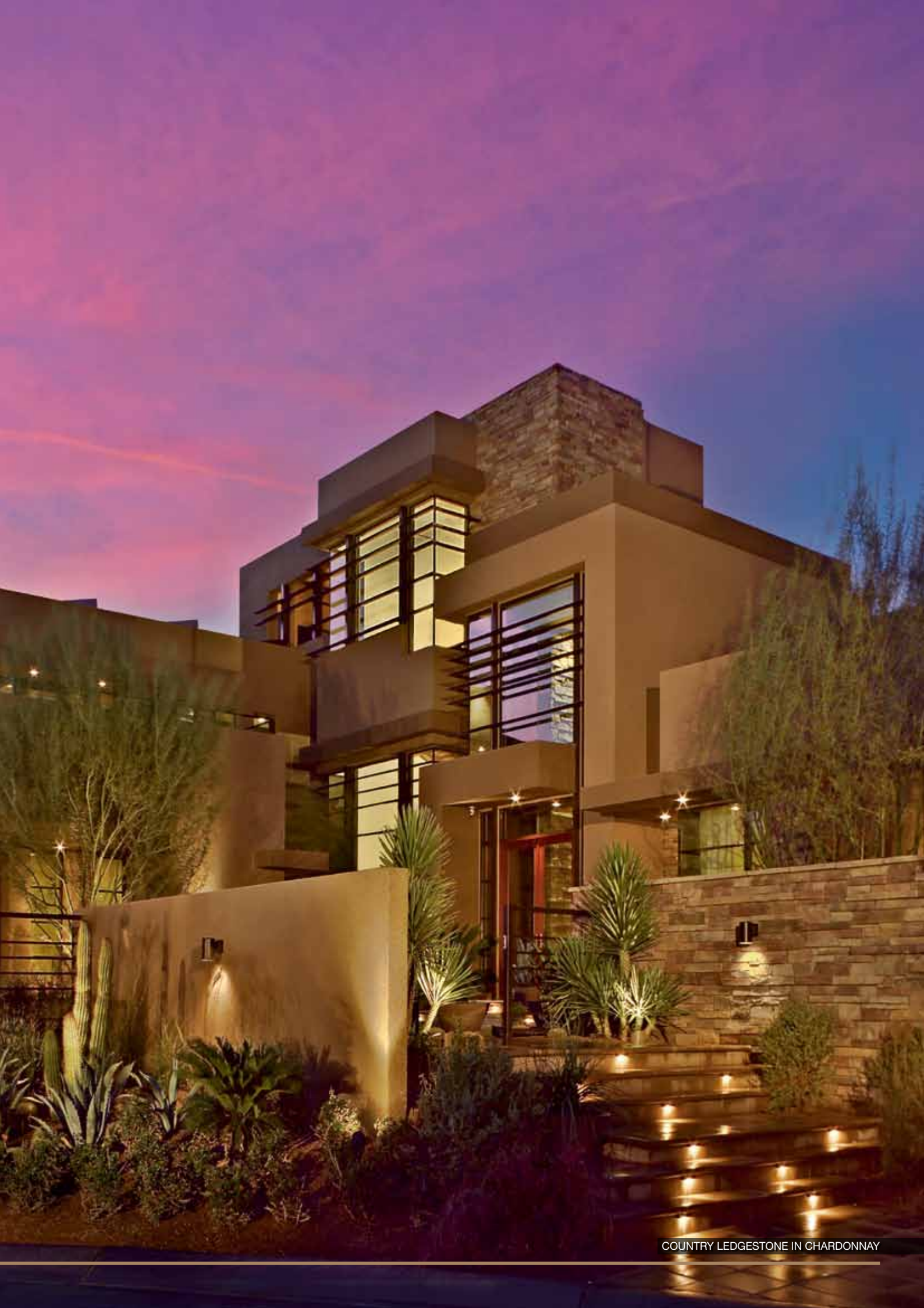
COUNTRY LEDGESTONE IN CHARDONNAY