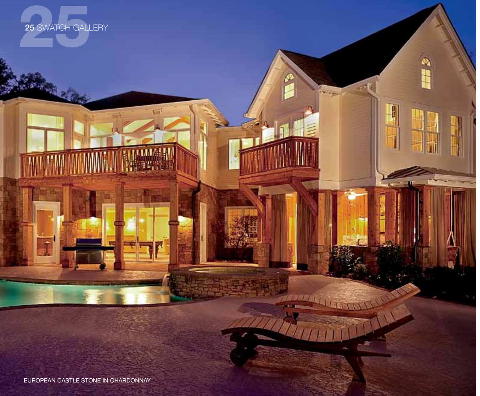
EUROPEAN CASTLE STONE IN CHARDONNAY