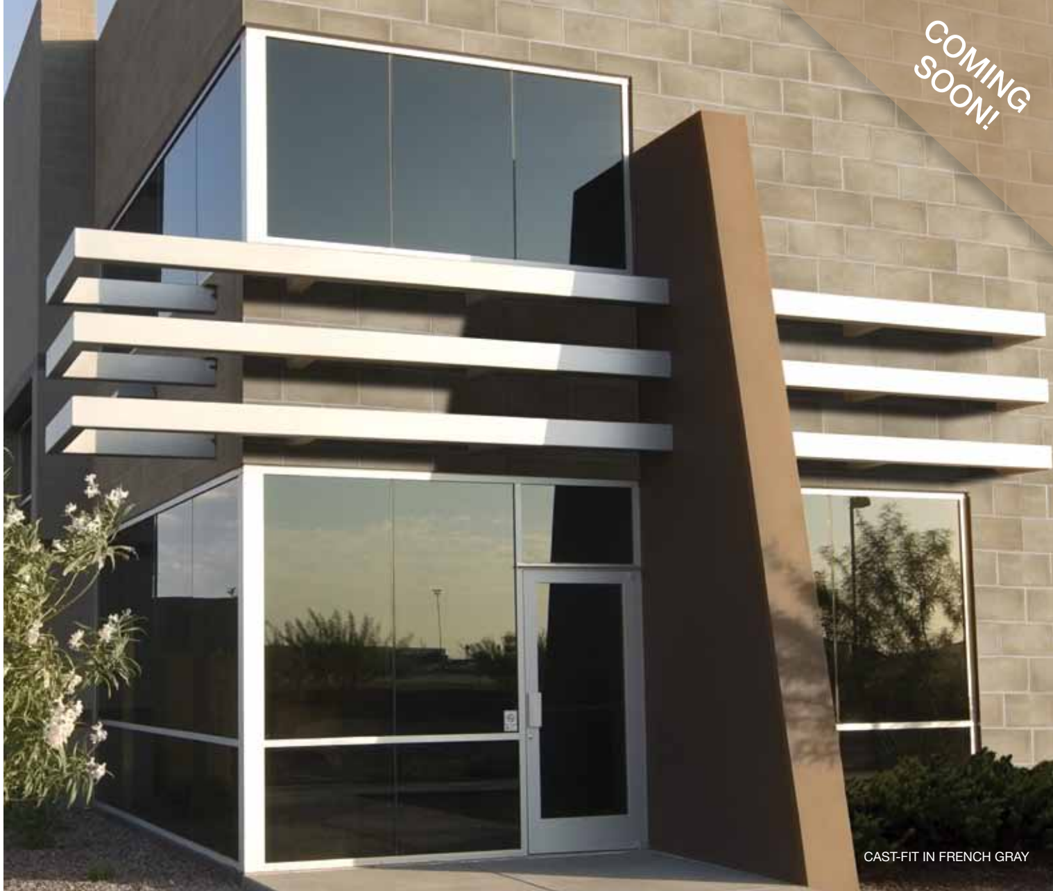
CAST-FIT IN FRENCH GRAY