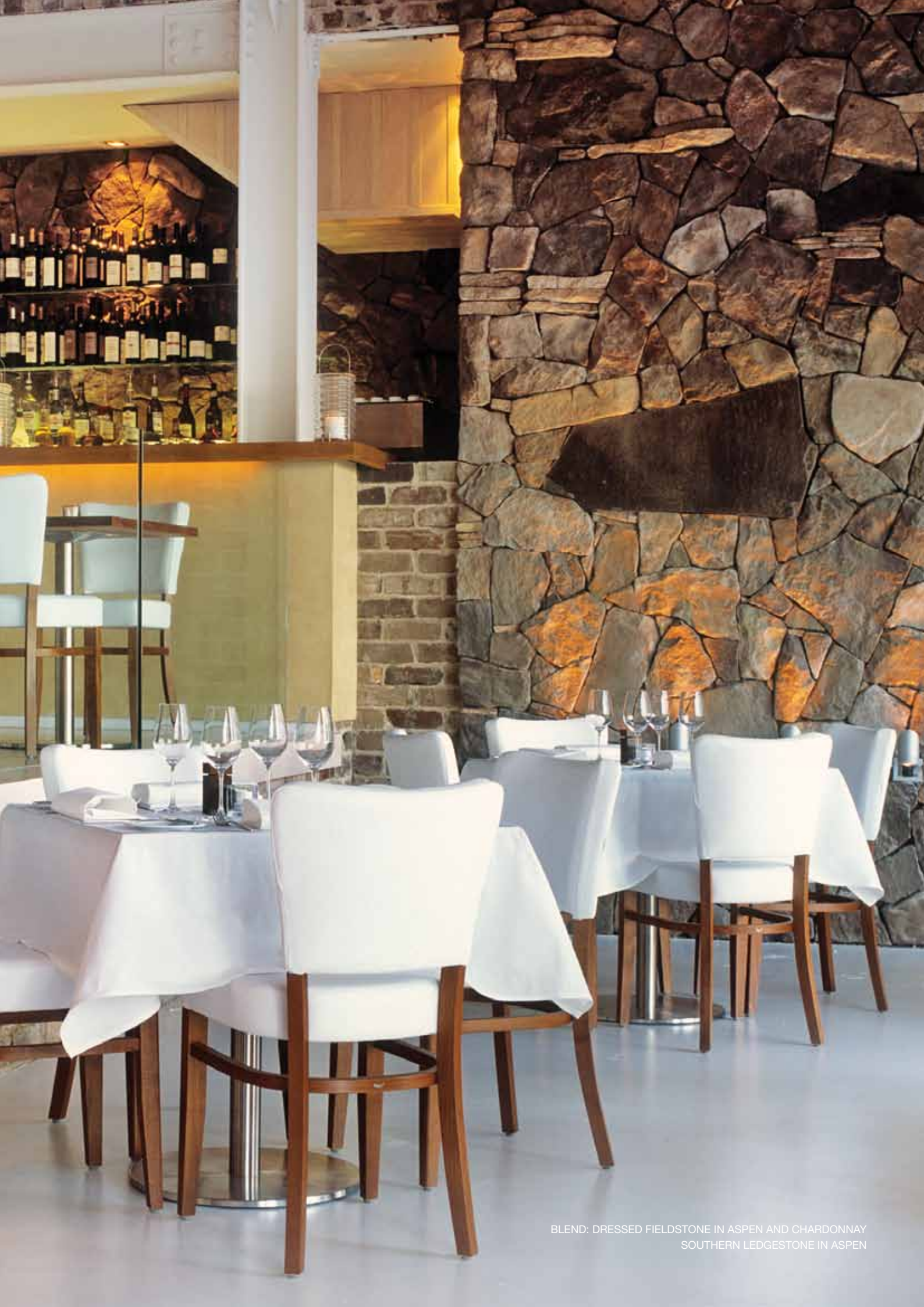
BLEND: DRESSED FIELDSTONE IN ASPEN AND CHARDONNAY SOUTHERN LEDGESTONE IN ASPEN