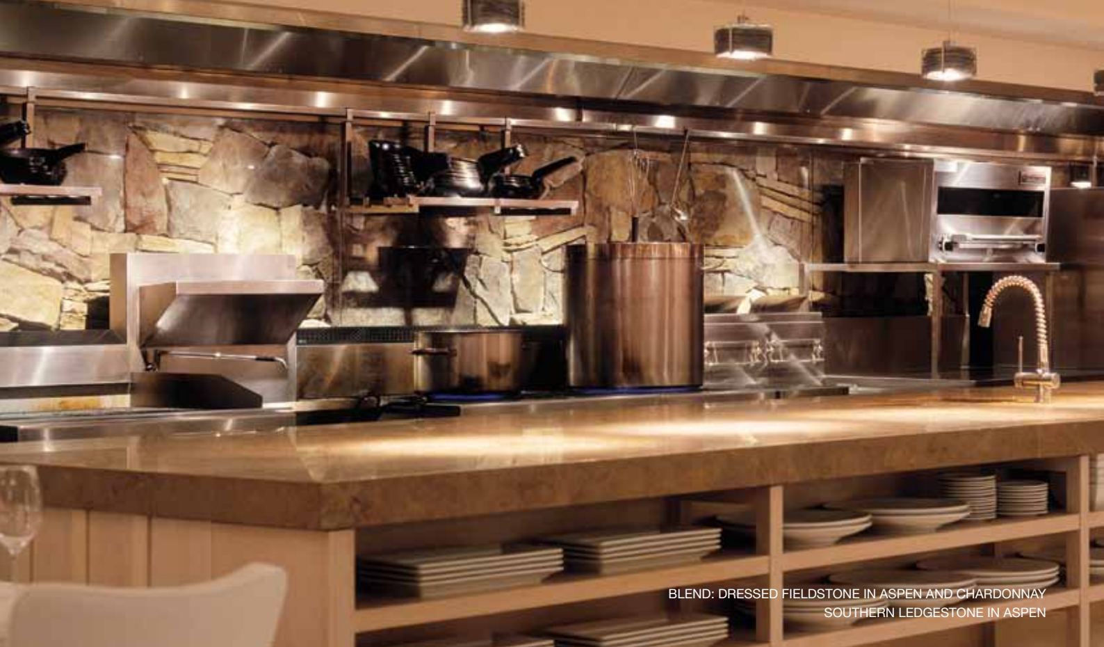
BLEND: DRESSED FIELDSTONE IN ASPEN AND CHARDONNAY SOUTHERN LEDGESTONE IN ASPEN