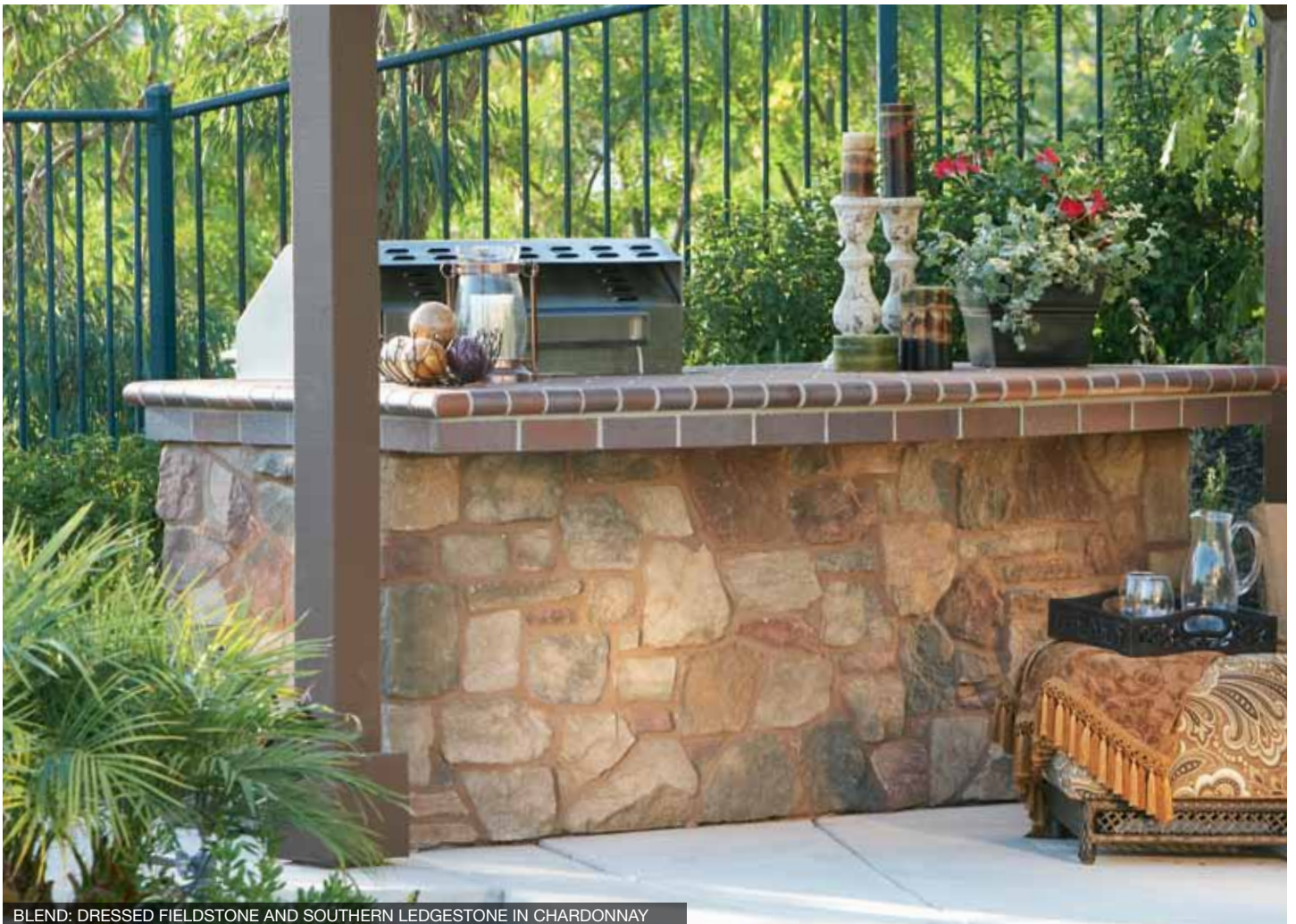
BLEND: DRESSED FIELDSTONE AND SOUTHERN LEDGESTONE IN CHARDONNAY

Cultured Stone is engineered to last, maintaining its beauty and strength for at least 50 years*. Furthermore, Cultured Stone cladding does not require painting, coating or sealing after installation**.