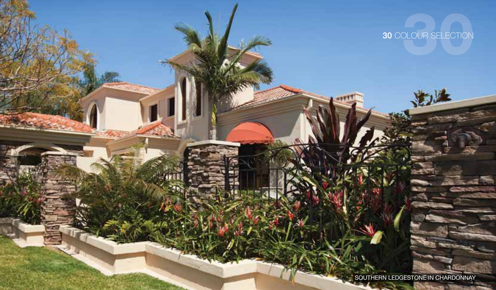
SOUTHERN LEDGESTONE IN CHARDONNAY