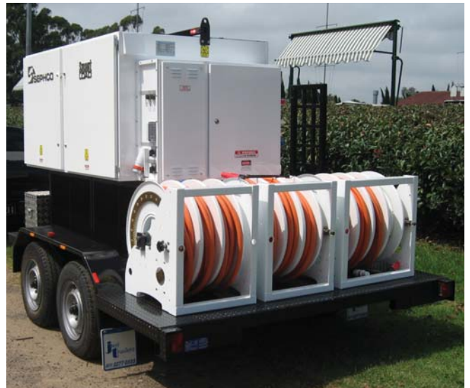
Gen set cable storage reels