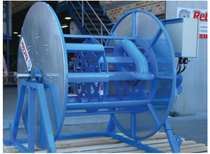
Pneumatic rewind 4" debunkering reel