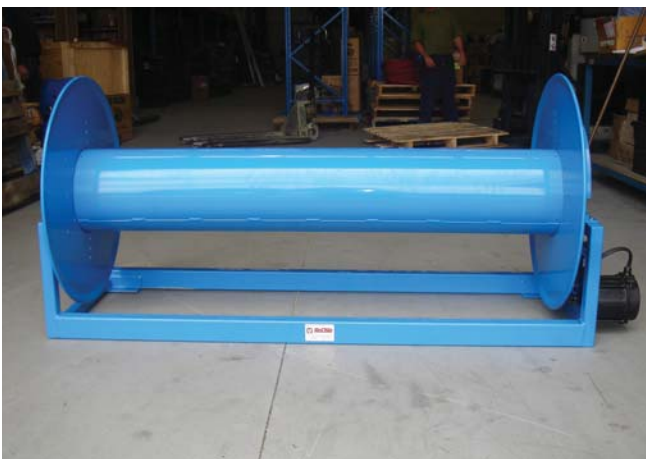
Bio hazard mat reel