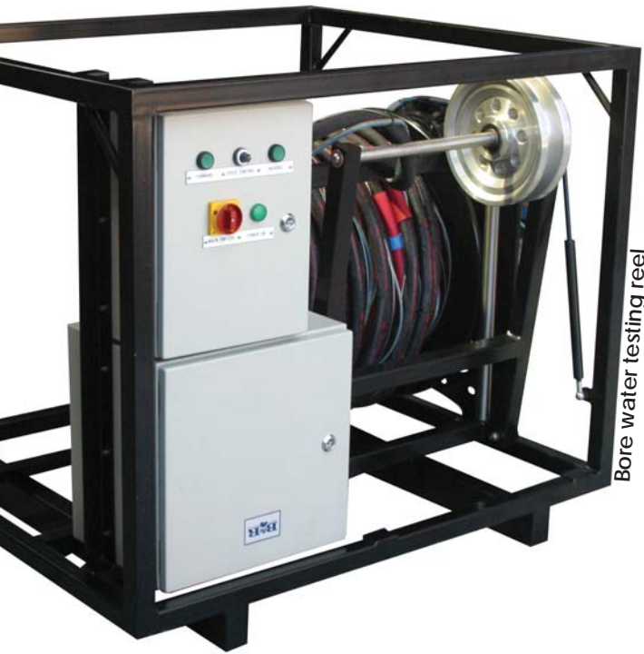
Bore water testing reel