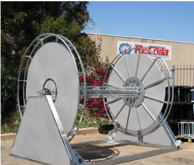
Large volume storage reels