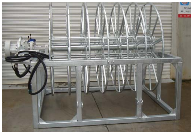
Multi-spool debunkering reel

CONTACT US WITH YOUR SPECIFIC REQUIREMENTS