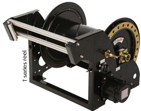
T series reel

ReCoila's experience in designing & manufacturing hose and cable reels for some 30 years extends to custom designed and manufactured reels for all types of applications including mining, offshore, petrochemical, marine, industrial and more.