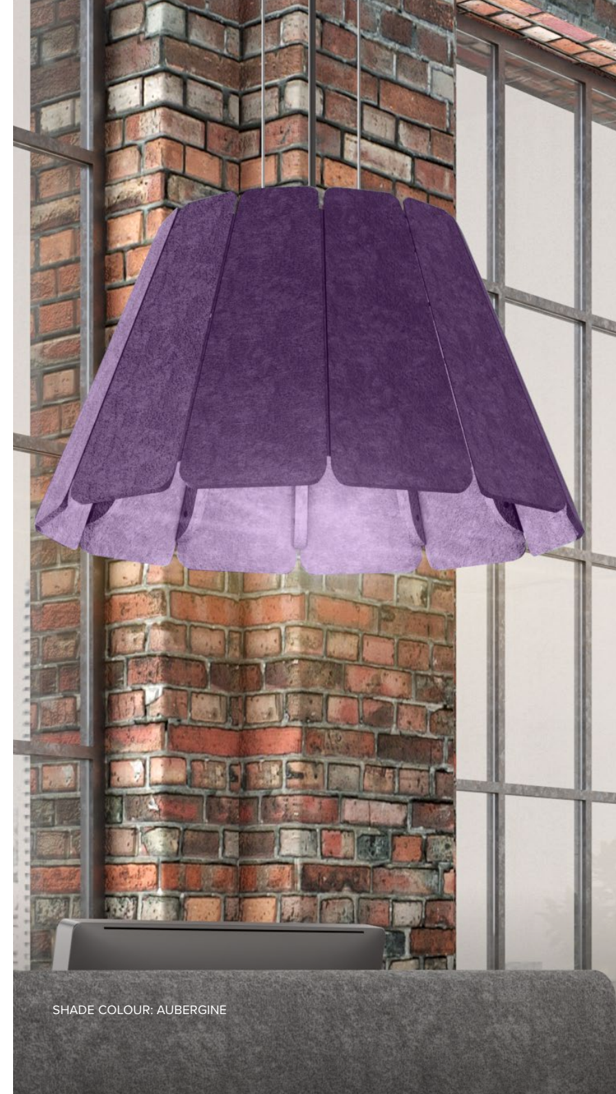
SHADE COLOUR: AUBERGINE

Fire Hazard Properties: The following results were obtained when subjected to early fire hazard testing in accordance with Australian Standards AS 1530.3 Ignitability | 7 Spread of Flame | 0 Smoke Developed | 5 Heat Evolved | 2