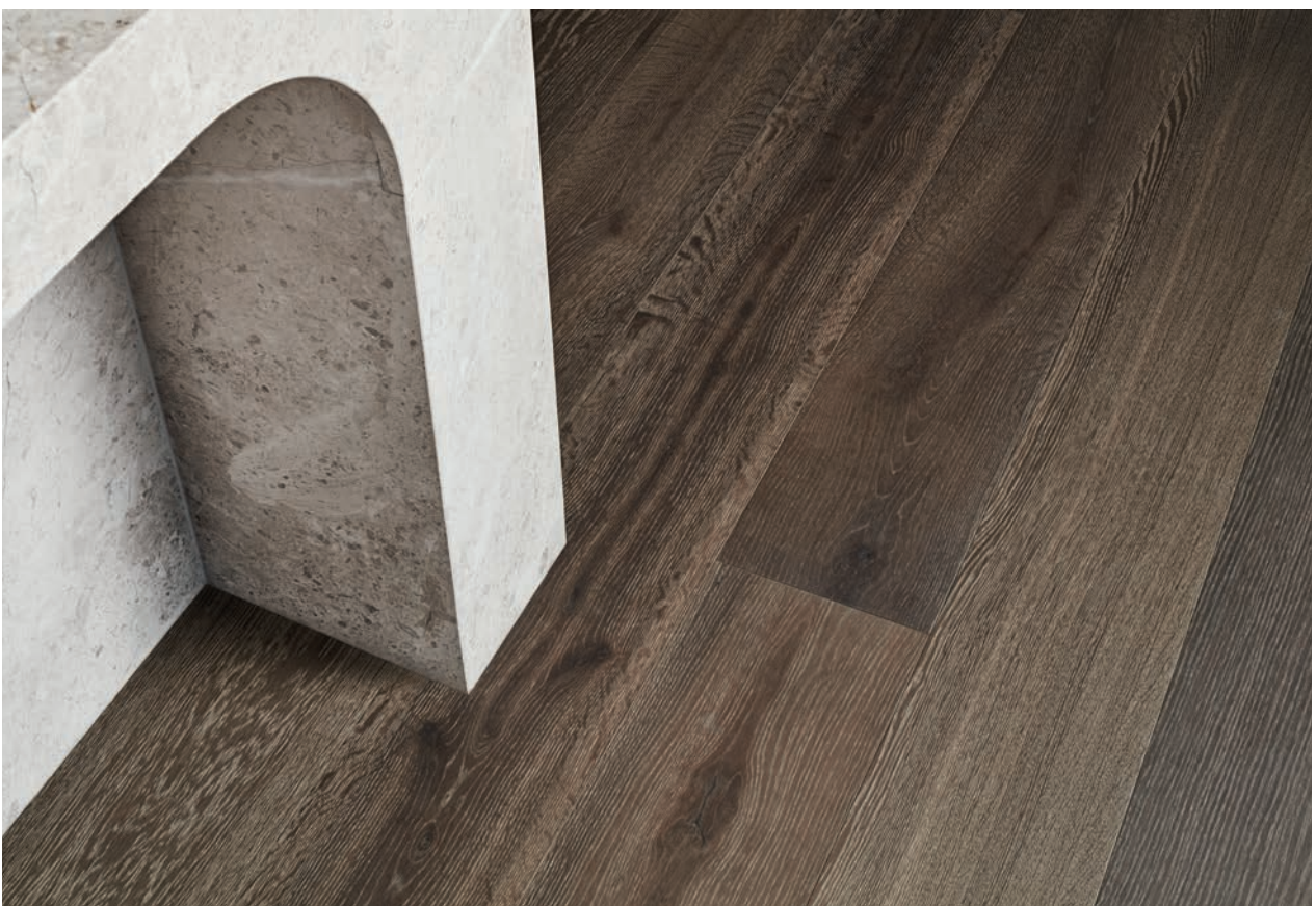
13 Clove oak wood