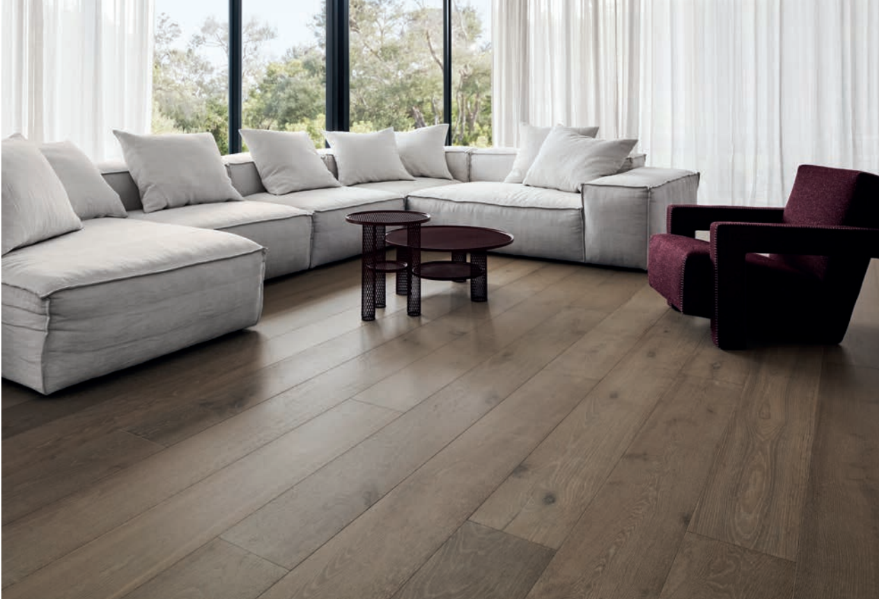
12 Truffle oak wood