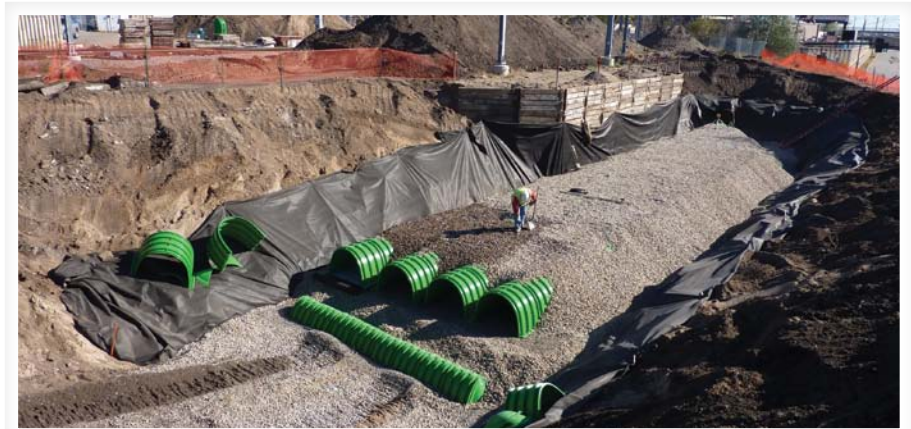
An impressive 10,213 cubic feet of storage was achieved with a 2,837 square foot project site, using Triton SWS’ double-stacking capability.

Triton Stormwater Solutions innovative underground chambers, boasting large storage capacity and unrivaled strength – which allows them to be stacked to increase storage volume while saving space – meant that the project could meet the stringent requirements without disrupting the existing site infrastructure.