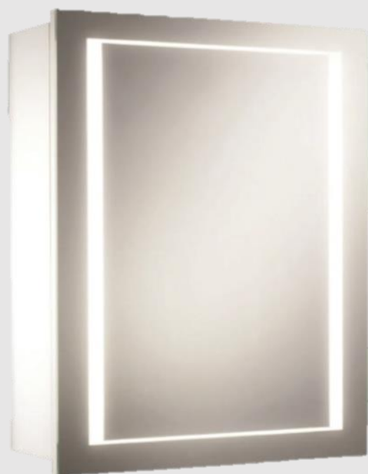
Position of holes for adjustable shelves