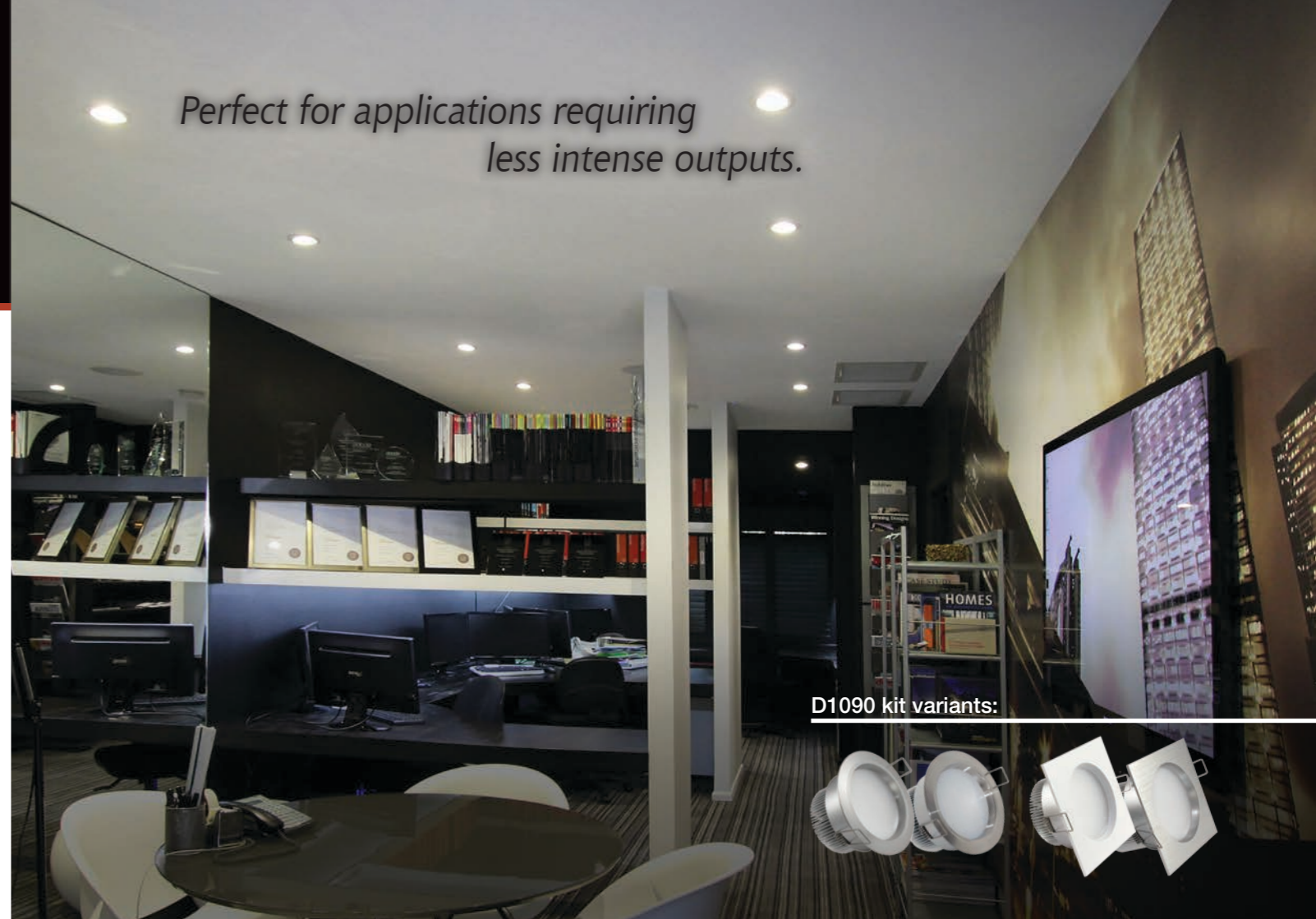
D1090 kit variants:

Perfect for applications requiring less intense outputs.