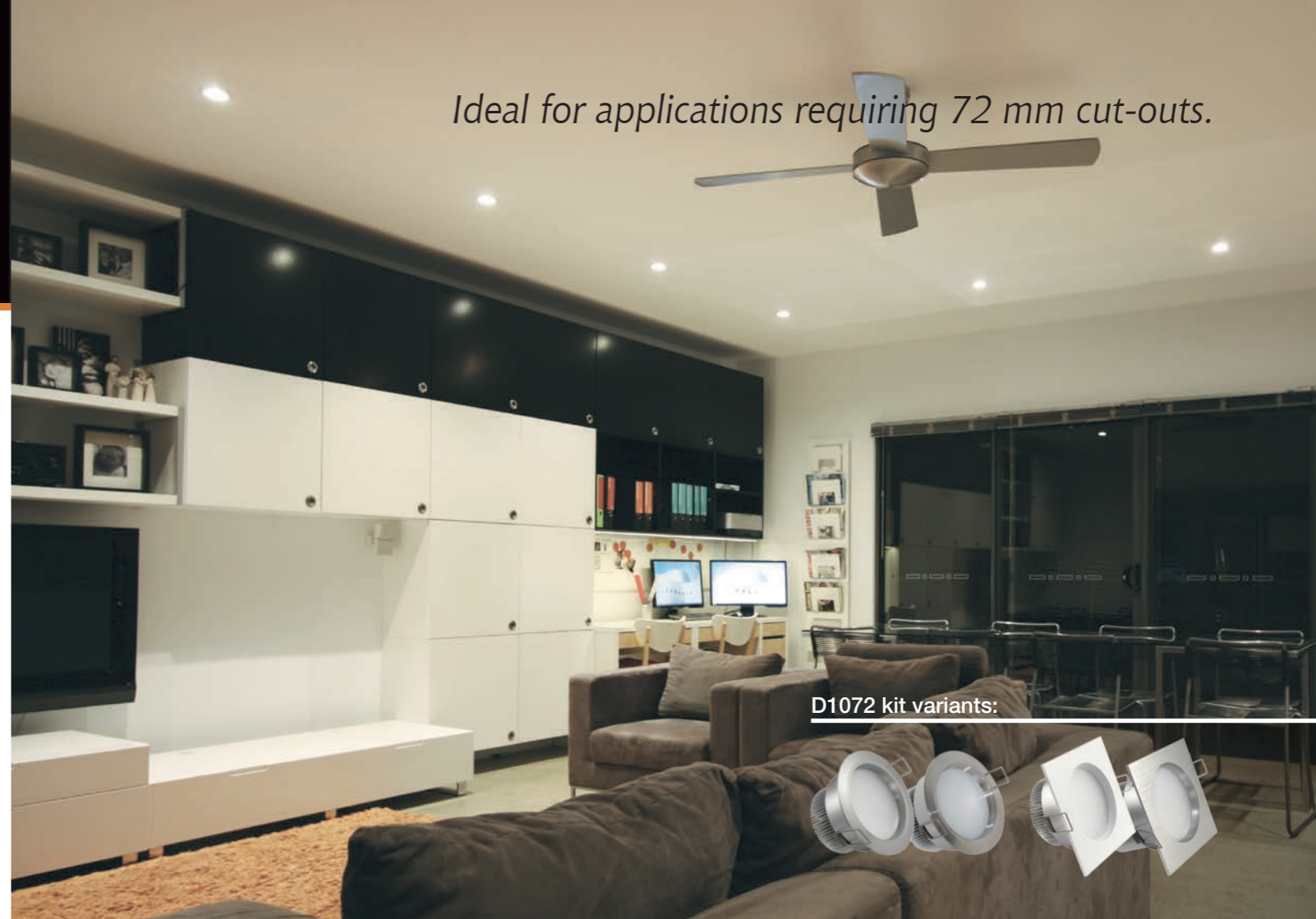
D1072 kit variants:

Ideal for applications requiring 72 mm cut-outs.