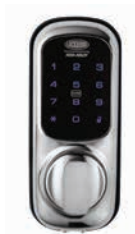
Keyless Digital Deadlatch

Make your world keyless with Lockwood: no worries® .