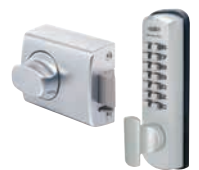
002DX Keyless Deadlatch