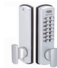
530DX Keyless Entrance Set