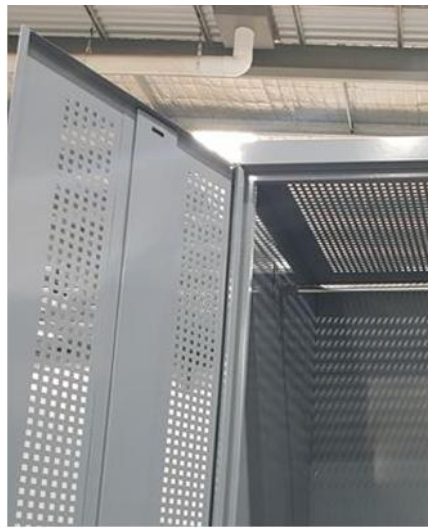
Perforated doors and top panel