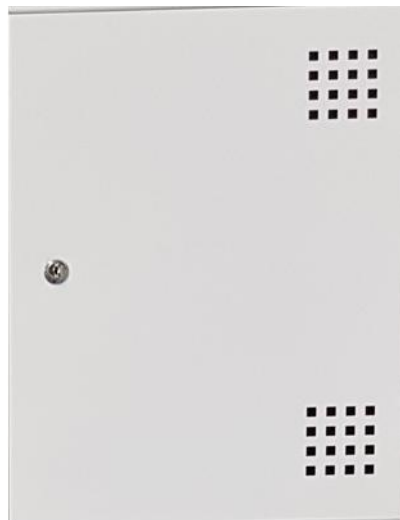
Right Hand Facing Corners