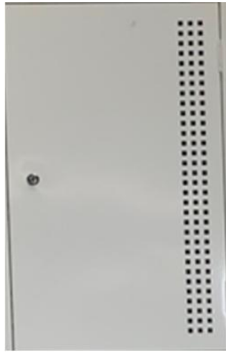
Square, Full Door Height