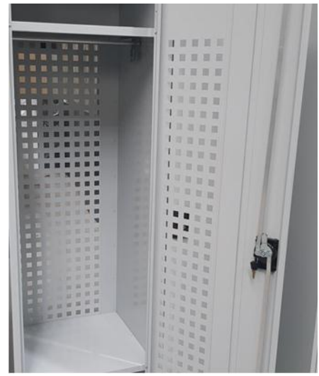
Perforated Door and Rear

Get in touch with Hi Tech Lockers now for your obligation free quote.