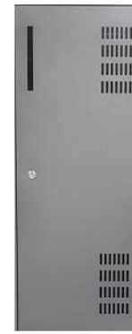
Slots with Adjacent Mail Slot

E: sales@hitechlockers.com P: 1300 17 55 99