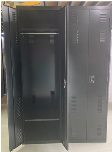
Louvres, Front and Rear