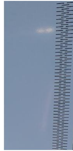
Offset Slots, Full Door Height