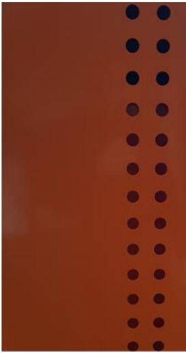
Round, Full Door Height