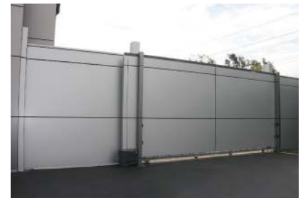
Customised sliding gates