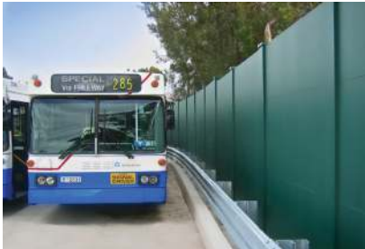
Acrylic paint - spray or roller application

The system once installed is ready to accept any self-priming acrylic paint (no additional primers needed). Where graffiti may be a concern, a final coat of Anti-Graffiti paint is recommended.