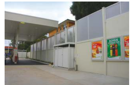
Acrylic screening - service stations