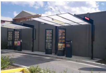
Fast food drive-through application

Every BarrierWall™ can accept multiple features such as lighting, intercoms, cameras, feature panels or acrylic screens.