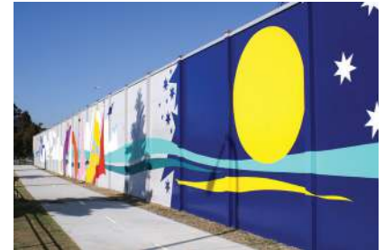
Customise your next wall project