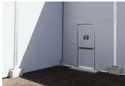
Pedestrian gates / doors