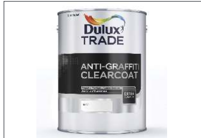
Anti-Graffiti top coatings available