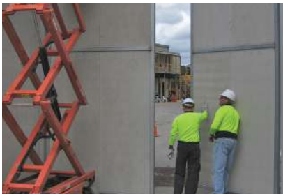
Large vehicular access swinging gates

Gates are available for acoustic security or access applications - custom made for specific applications.