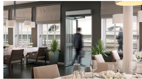
ASSA ABLOY SW100 B

The balance swing door system is designed to work in narrow passages and corridors and is strengthened to withstand the pressure of intense traffic, windy conditions, cross-drafts and air pressure. Available in two versions: ASSA ABLOY SW100 B and ASSA ABLOY SW200 B.