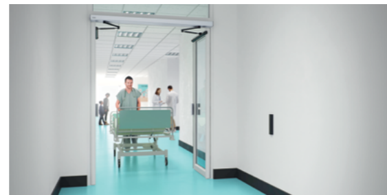
ASSA ABLOY SW300 F

The ASSA ABLOY frame swing door system has a robust and reliable frame profile, suitable for high-traffic areas. Safety features such as finger trap protection and a choice of operator options mean this door can be configured to suit your application.