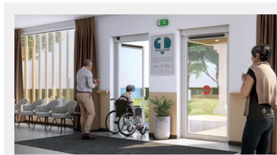
ASSA ABLOY SW200 I