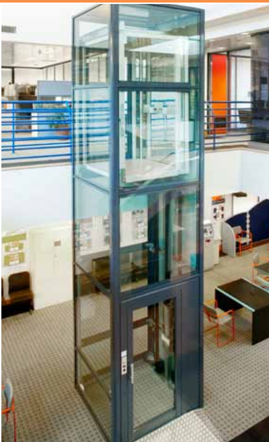
DOMUSXL LIFT 0-4 metres travel