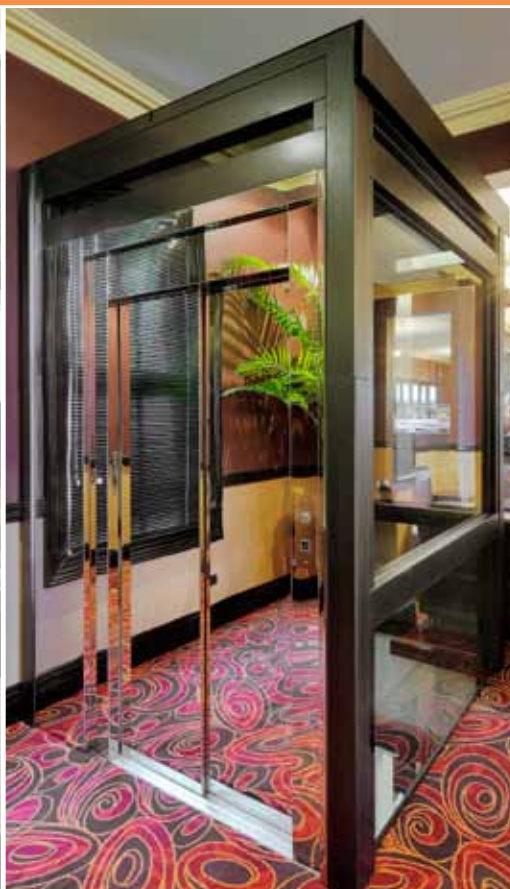
DOMUS EVOLUTION LIFT 0-12 meters travel