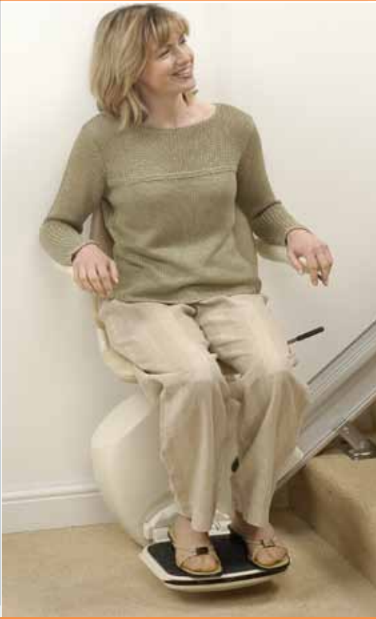
MEDITEK STAIRLIFT For Stairs