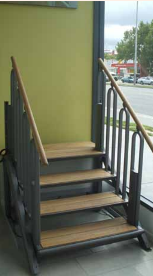
EASystem PLATFORM LIFT 0-1 meters travel