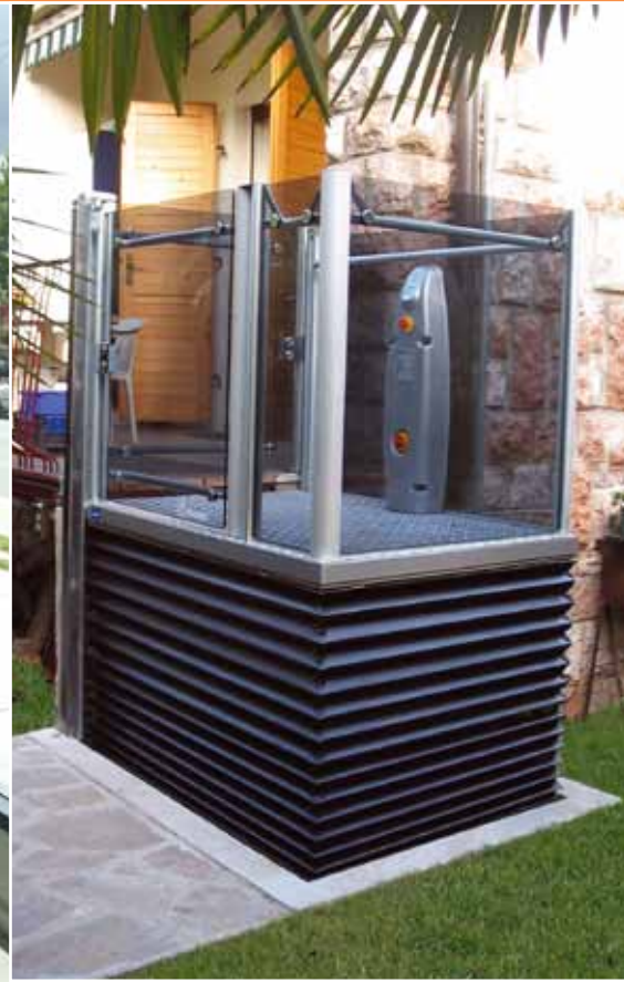
GLAZE LOW RISE PLATFORM LIFT 0-2 meters travel

They are a free-standing design that does not require to be installed against a load bearing wall, allowing a wider choice in positioning the location of the lift.