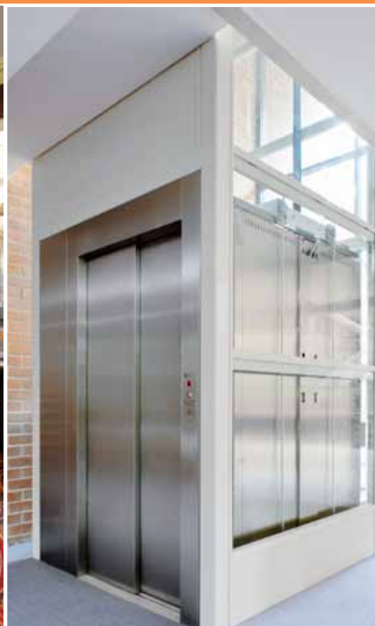
SUPERDOMUS LIFT 0-12 meter travel