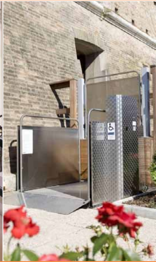
SILVER LOW RISE PLATFORM LIFT 0-1 meter travel

Easy Living Home Elevators prides itself on delivering a full range of reliable and versatile product solutions to meet growing accessibility needs in residential and commercial applications where ramps are not possible or where access is required by wheelchair users or those less mobile along a stairway.