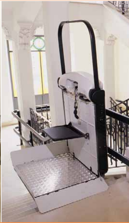
VIMEC WHEELCHAIR STAIRLIFT For Stairs