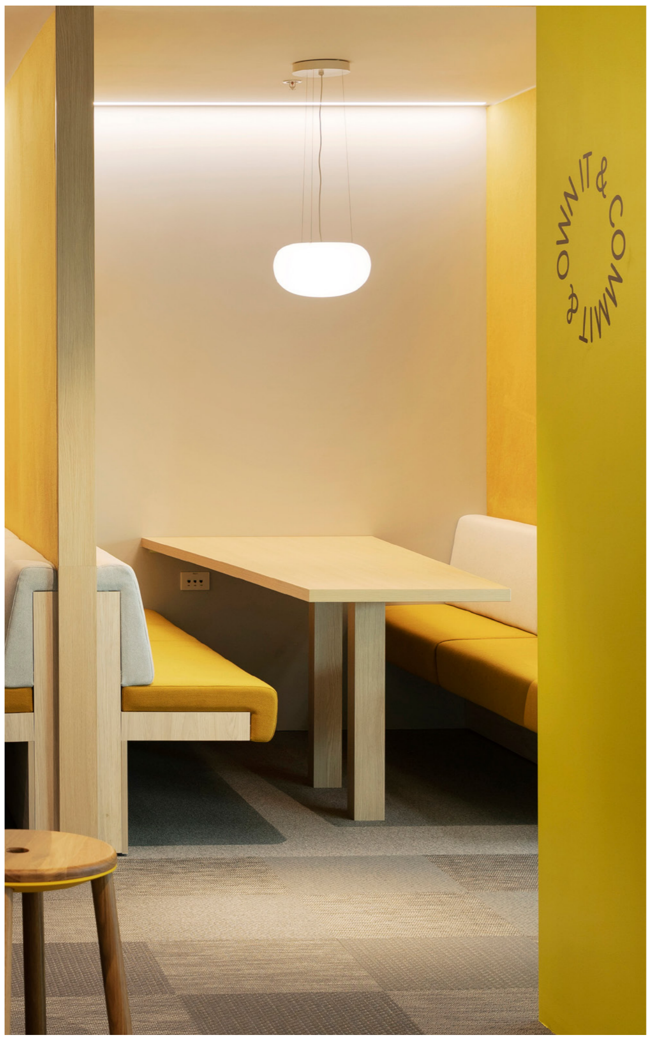
● Composition in Clay