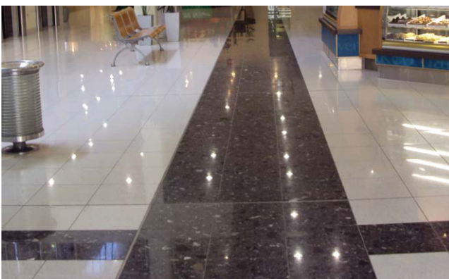
New Plymouth Centre City Mall New Zealand. Commercial application with ARDEX DS60 Decoupling Mat System

GREEN BUILDING APPLICATION A low VOC product that meets the Green Building Council of Australia standards.