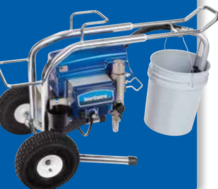
Lo-Boy easily carries a standard 5-gallon paint bucket.