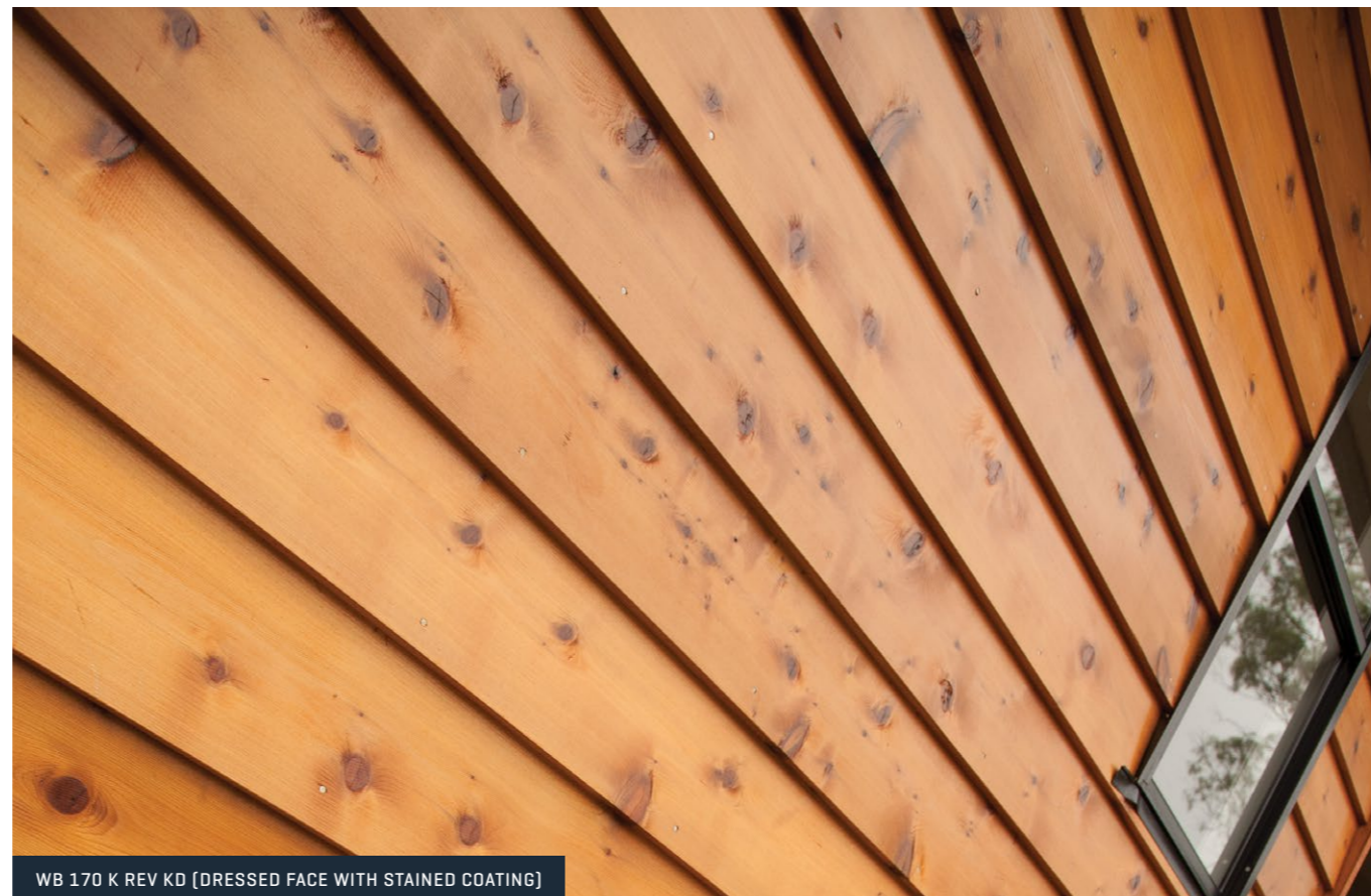
WB 170 K REV KD [DRESSED FACE WITH STAINED COATING]