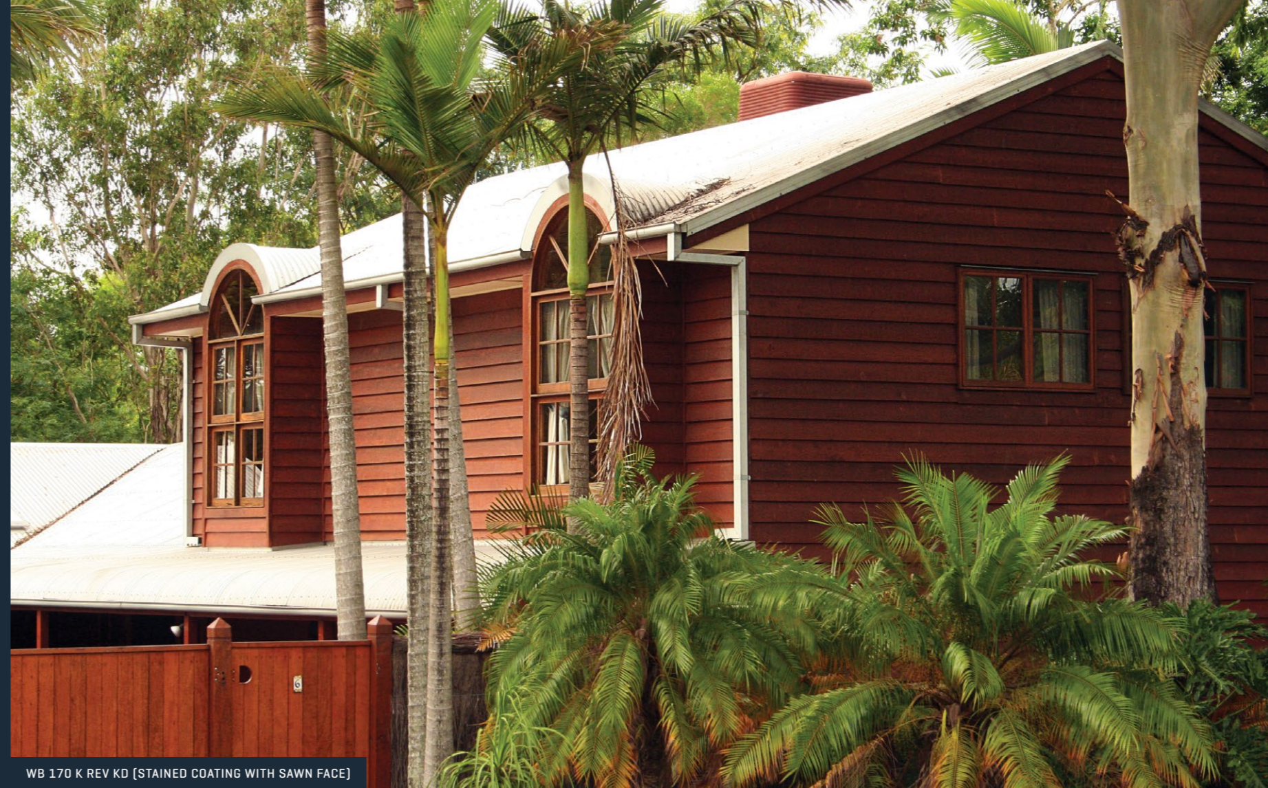
WB 170 K REV KD [STAINED COATING WITH SAWN FACE]