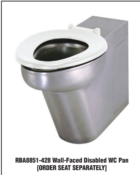
RBA8851-428 Wall-Faced Disabled WC Pan [ORDER SEAT SEPARATELY]