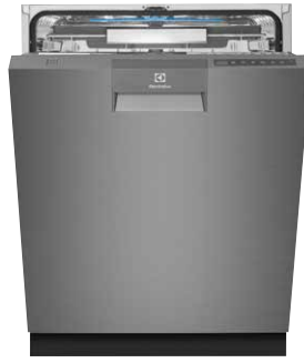
ESF8735RKX Built-under dishwasher with ComfortLift®