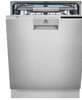
ESF8735ROX Built-under dishwasher with ComfortLift®