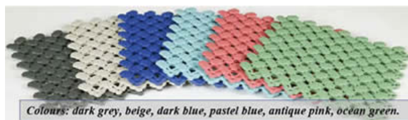
Colours: dark grey, beige, dark blue, pastel blue, antique pink, ocean green.