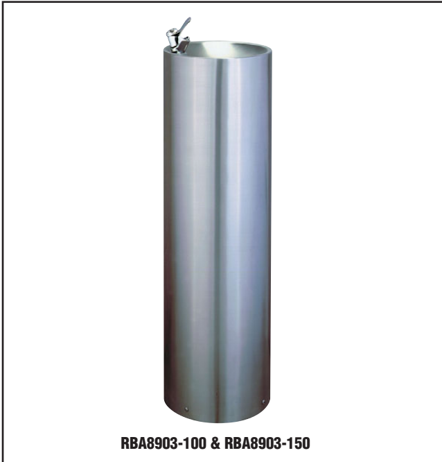
RBA8903-100 & RBA8903-150