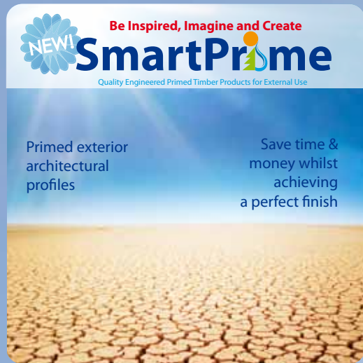
SmartPrime Pre-primed Pine Profiles

Globally there exists two major certification bodies that coexist with the express aim of verifying and certifying sustainably managed timber resources and ensures that sustainable timber that is branded as such holds validity in terms of the claims made. We are happy to report that FrameSmart products are sourced from certified plantations and we are able to provide, upon request, chain of custody validated pine framing products.