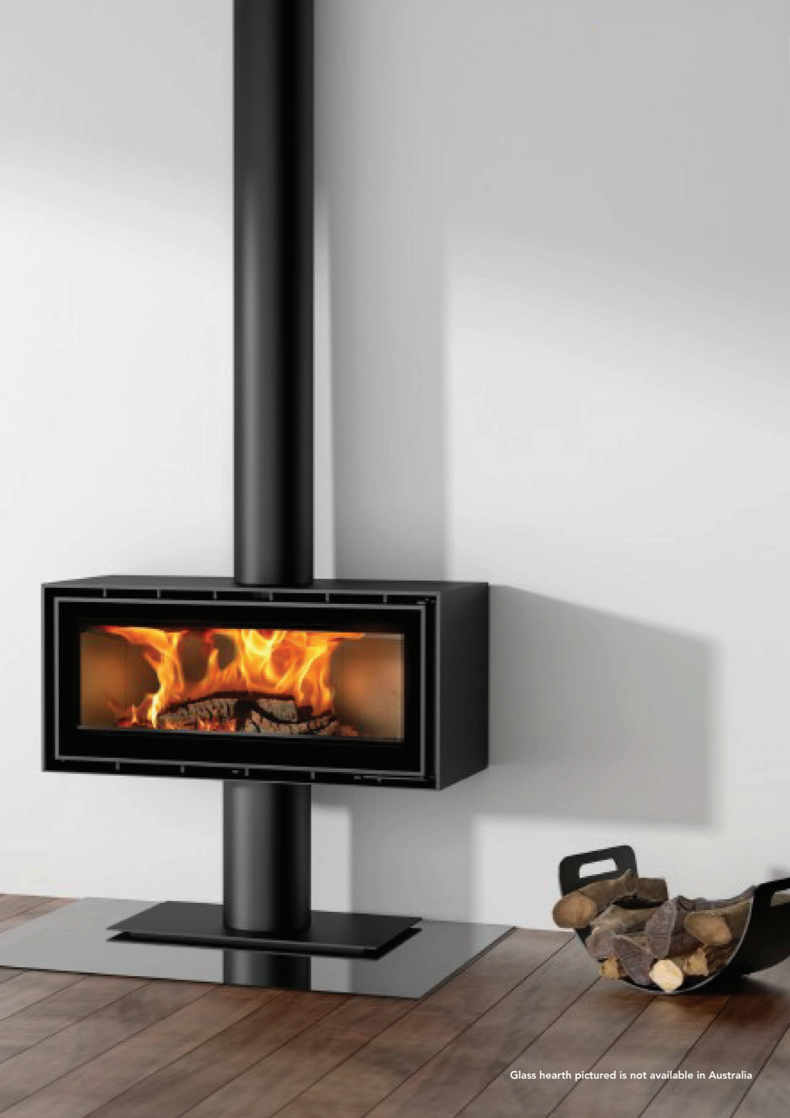
Glass hearth pictured is not available in Australia