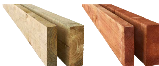
Ironwood Classic Sleepers (CCA)

Ironwood Sleepers are available in two treatment types – Classic (CCA) and Sienna (MicroPro) and are ideal for residential and commercial non-structural applications.