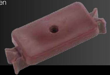
Dura Deck Hidden Fixing Clip

Colours and images shown are for illustration purposes only. Actual colours may vary slightly. All decking installations should comply with Building Code of Australia guidelines, ensuring adequate spacing and ventilation.