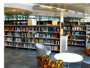
Hale School, WA