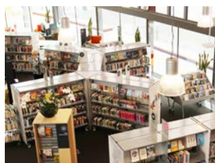
Williamstown Library, VIC

Raeco® has an extensive range of shelving options in a variety of colours for all your library needs. A great range of accessories are available to complement your Raeco® shelving. These include: bookends, index blocks, bayend panels, shelf labels, display easels and signage.