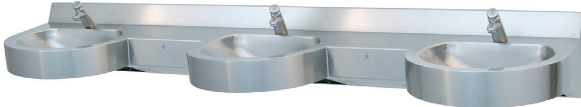
RBA8889-381 Curvalinear™ Triple User Basin (Shown with optional tap RBA1083-607)