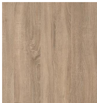
45 sheets of Dekodur Laminate D070/SMT