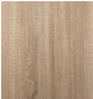
93 sheets of Dekodur Laminate D070/BWD

The range of materials stocked by Allplastics include PERSPEX; coloured Acrylic Mirror, Polycarbonates, Design Composite translucent decorative panels; TOTAL Stone Cladding Panels. In addition Allplastics offer custom acrylic fabrication and CNC routing services for a diverse range of industries.